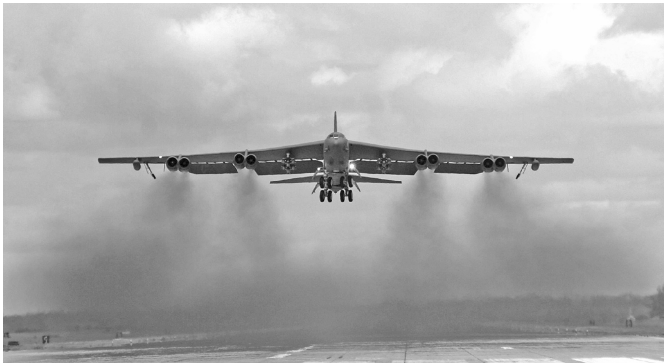
B-52 Stratofortress bomber takes off from a classified location on its way to Afghanistan in support of Operation ENDURING FREEDOM.