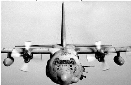
The AC-130 gunship's primary missions are close air support, air interdiction, and force protection.

Ongoing operations continue to demonstrate the Army requirement for terminal attack control capability to maneuver at company level. The Air Force is increasing joint terminal attack controller (JTAC) authorizations/structure and will increase this structure to meet Army requirements. However, training JTACs in the required knowledge and procedures will take some time. To mitigate this gap, Soldiers are being trained in the skills needed to work with a JTAC, as an extended set of eyes, providing targeting data and terminal guidance, if required. These Soldiers are referred to as Joint Fires Observers (JFOs) and the Army's goal is one JFO per maneuver platoon.