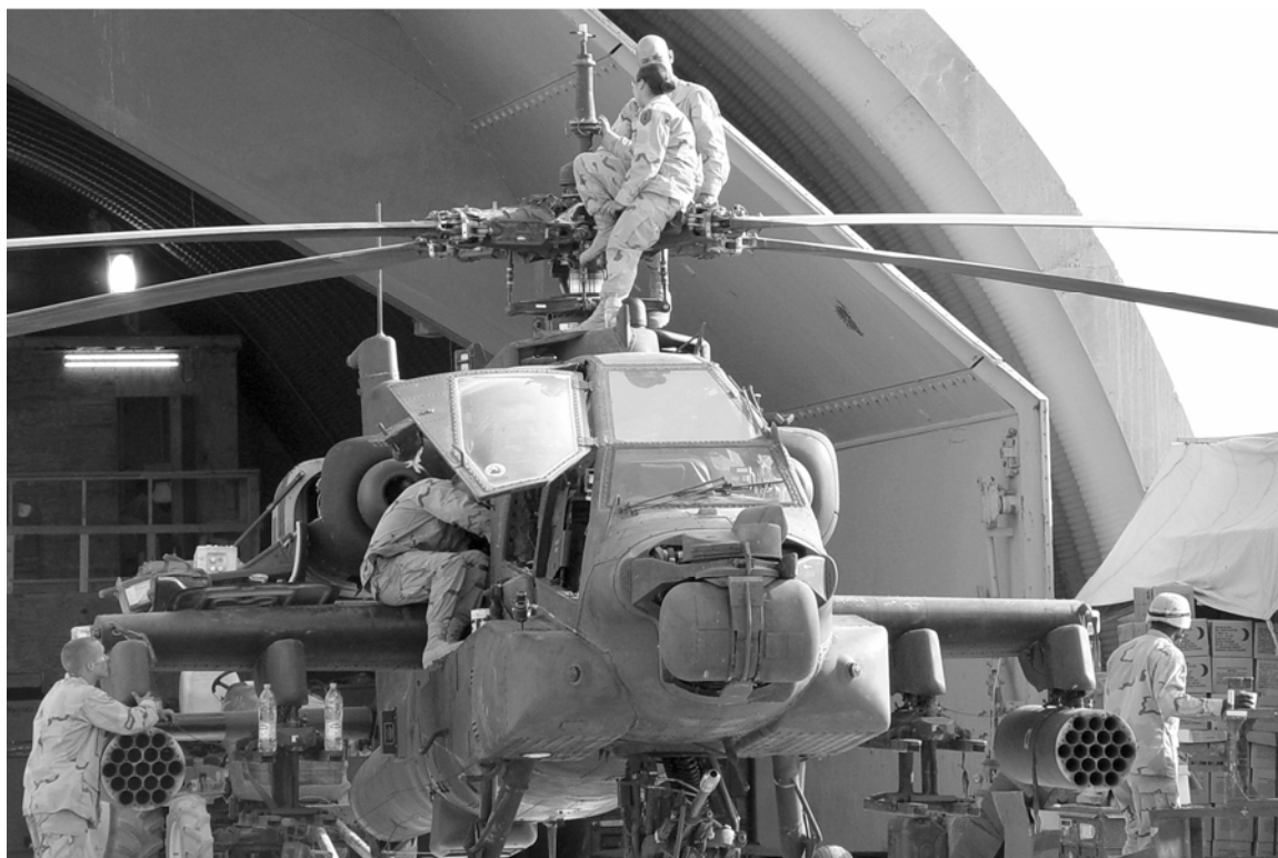
Soldiers perform maintenance on an AH-64 Apache attack helicopter on Forward Operating Base Speicher in Iraq.

...ongoing training and qualification of JFOs are key factors in their success.