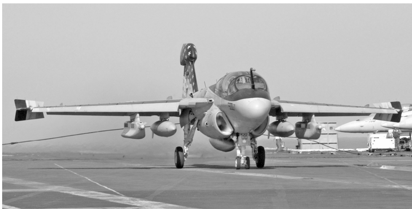
An EA-6B Prowler aircraft assigned to the "Patriots" of Electronic Attack Squadron One Four Zero makes an arrested landing aboard Nimitz-class aircraft carrier USS Dwight D. Eisenhower (CVN 69) in the Arabian Sea.