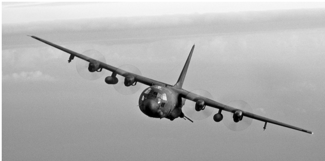
A special operations wing AC-130 Hercules gunship on a training mission over the Gulf of Mexico.

JSTARS can pass all the information required to coordinate with the gunship crew