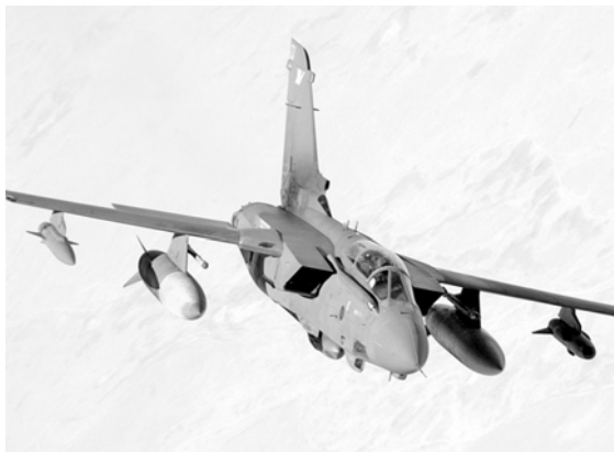
Royal Air Force GR4 Tornado fighter over Iraq during a combat mission in support of Operation IRAQI FREEDOM.

Limitations. The GR9 lacks a gun; this is in part compensated for by the use of the rockets.