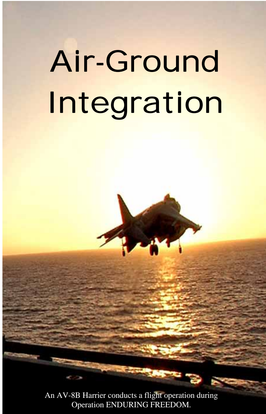
An AV-8B Harrier conducts a flight operation during Operation ENDURING FREEDOM.