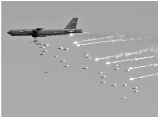
B-52 Stratofortress bomber drops live ordnance over Point Bravo, Nevada, during a firepower demonstration.

track, target, engage, and assess. Moreover, the bomber can support other SCAR assets with electronic attack.