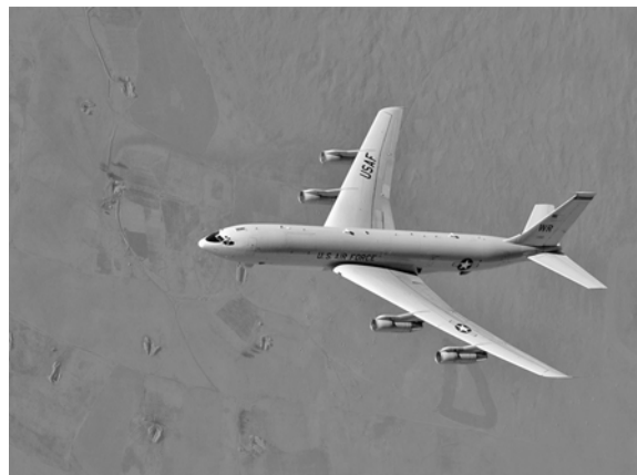
E-8C Joint Surveillance Target Attack Radar System, 12th Expeditionary Airborne Command Control Squadron, in flight over Iraq in support of Operation IRAQI FREEDOM.

...integration of the two platforms allows the kill chain to be accomplished more efficiently.