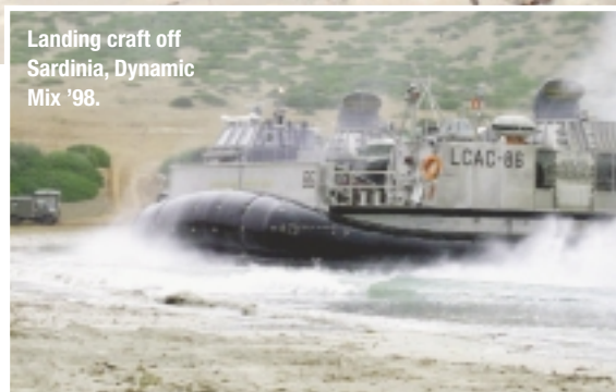
Landing craft off Sardinia, Dynamic Mix '98.