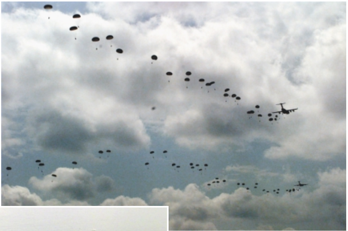
1 st Combat Camera Squadron