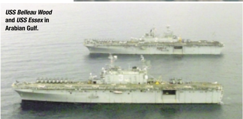
USS Belleau Wood and USS Essex in Arabian Gulf.