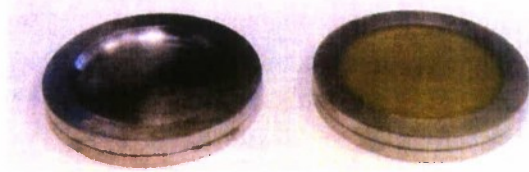
Figure 1- Sandwich structures

A 3" Hopkinson bar setup with Aluminum bars was used for the experiments. Three different configurations for the circular sandwich structures were considered: steel-steel, steel-polyurea-steel and steel-polyurea-steel-polyurea. The Naval structural steel, DH-36, is used to manufacture the samples. The sandwich structure is placed between a cylindrical layer of soft polyurethane and a hollow steel ring. When the gun is triggered, high-pressure gas accelerates the projectile through a barrel towards the target. The projectile, which is made of aluminum, impacts the target at a high velocity, which is accurately measured by two magnetic sensors placed at the end of the barrel. Polyurethane, which is nearly incompressible, is now confined between the projectile and the sample. This subjects the sample to a pressure pulse applied to the sample. The history of transmitted force from the sample to the output bar is recorded by two strain gages mounted on the Hopkinson bar.