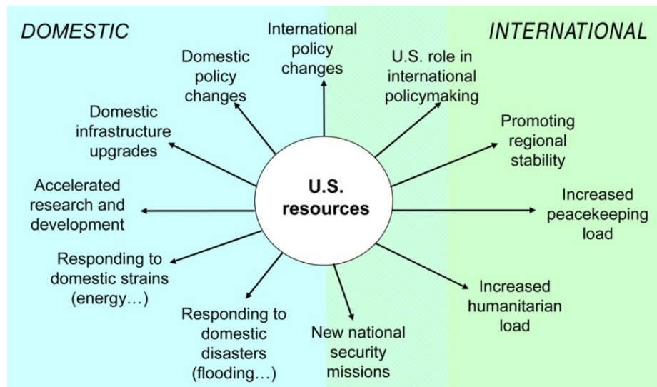
Figure 8. Climate Change and U.S. National Security (Lynch 2009)

Similar to the previous section, this section starts by looking at security issues specific to the Arctic. It then considers those that may arise elsewhere in the world and in the homeland. Issues pertaining to a national strategic approach to climate-related security issues is next, focusing on the necessary planning activities and their associated information requirements. The final topic is the coordination, both national and international, that must underlie a strategic approach.