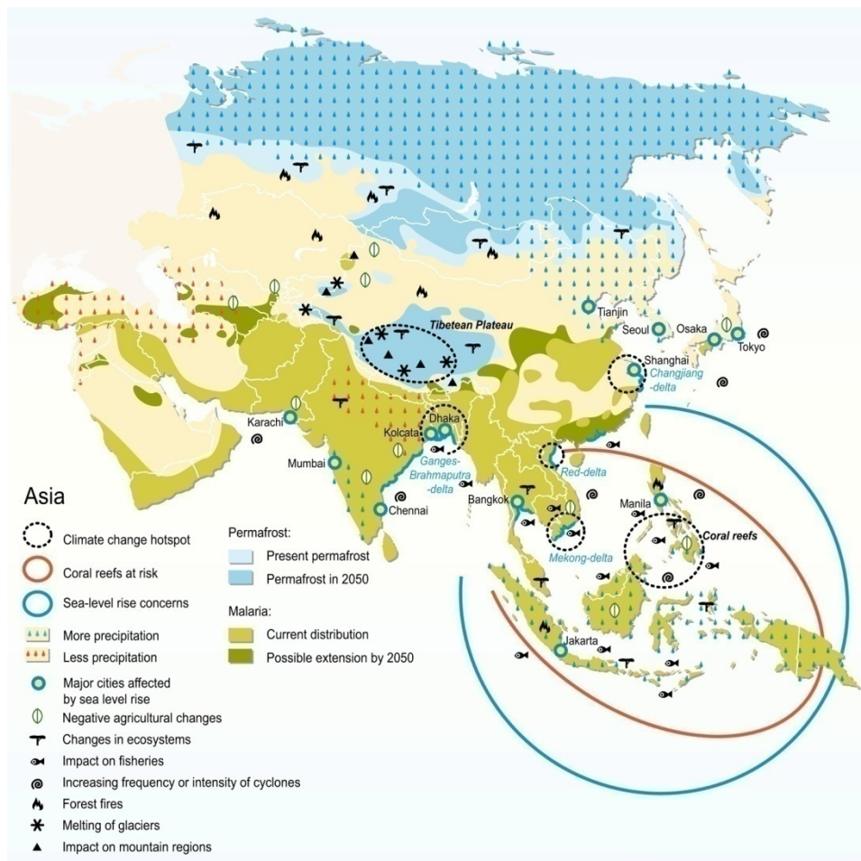
Figure 3. Climate in Peril, Asia (taken from UNEP 2009 ) 12

Implications elsewhere – It is widely acknowledged that the developing world will suffer the worst from climate change, primarily because these countries have little ability to absorb further stresses and have a reduced adaptation capacity. These countries may face multiple concurrent additional stresses, as demonstrated in Figure 3 and Figure 4. The geopolitical implications of two direct climate change impacts are given as illustrative examples in Figure 5 and the next two figures give examples of security issues at the secondary and tertiary levels.