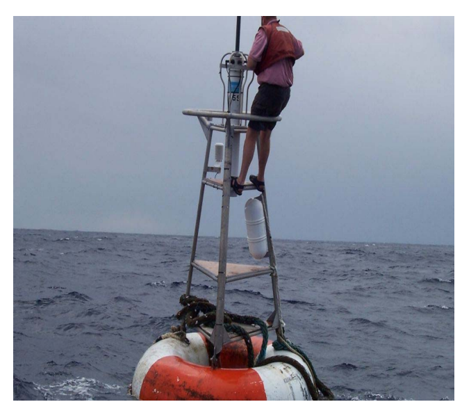
Figure 9 TAO vandalism – fishing activity (possible sling shot)

A recent case of buoy theft occurred at an NDBC TAO buoy resulting in the total loss of the asset. On May 1, 2009, the TAO mooring located at 8°N 95°W showed signs of vandalism evidenced by the simultaneous failure of all surface and subsurface instruments. Initial indications were that the buoy had been pulled from its anchor and was adrift (the equipment's Argos transmitter was still working and was providing track information). By the next day it became obvious that the equipment was on a ship as it was traveling at a high rate of speed. It made landfall at Puntarenas, Costa Rica on May 14, 2009 shortly after midnight GMT. The position of the equipment was relayed to the Costa Rican Coast Guard via the U.S. State Department on May 14. On May 15, the Costa Rican Coast Guard searched the area for the missing equipment, but was unsuccessful. The equipment stopped transmitting its position later that day, indicating that it had been taken inside or concealed.