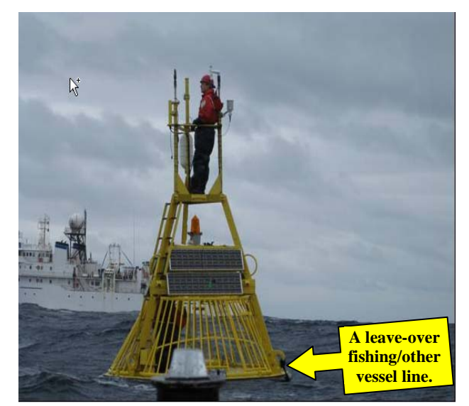
Figure 3 NDBC WxOP buoy vandalism: fishing activity