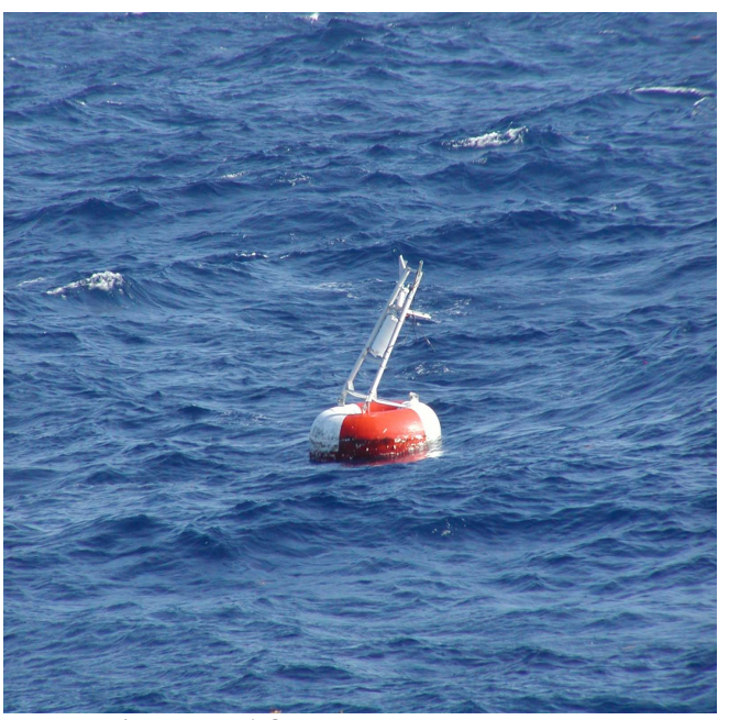
Figure 7 TAO buoy superstructure damage due to vessel collision