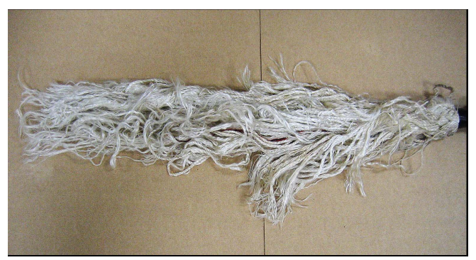
Figure 10 Tsunameter buoy vandalism: mooring line cut

In some cases, although NDBC categorizes them as unknown, it is likely that some of them were due to vandalism. For example, the tsunameter buoy at station 41420 (2.6D10) went adrift on 8/14/08 and was recovered by the NOAA Ship Nancy Foster on 5/13/09. The remaining mooring was recovered as well. The mooring parted in the <sup>3</sup>/<sub>4</sub>" nylon at about 1,000 meters depth. There were abrasion marks just above the break point. The buoy's superstructure was damaged including two welded joints and the lifting handle was significantly bent (as shown in Figure 11). This type of damage indicated that either a vessel had tied up to it or it suffered a collision.