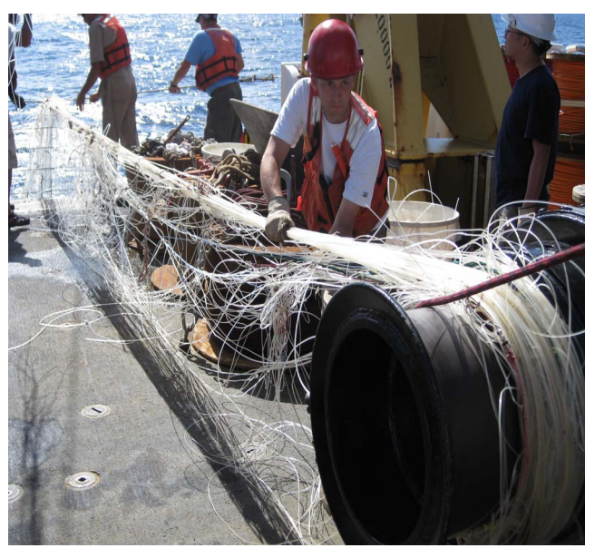
Figure 8 TAO buoy vandalism: long-line