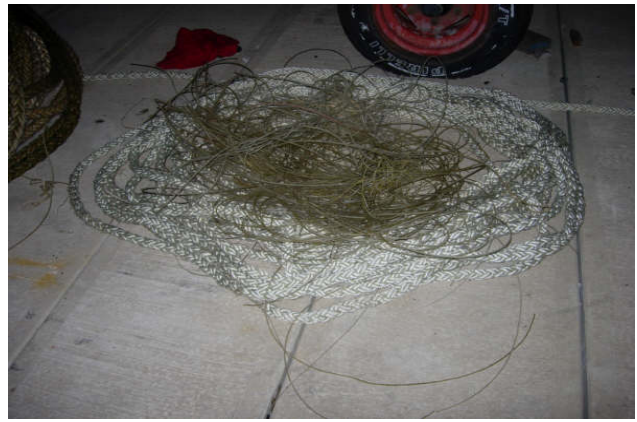
Figure 4 NDBC WxOP buoy vandalism: long-line