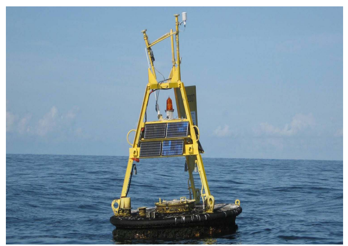
Figure 2 NDBC WxOP buoy damage due to vessel collision.

One may question why NOAA continues to maintain the observations at the problem locations. The reason is that the data at these locations are of such importance to the weather service and the respective stakeholders that the cost of not having the observations are dramatically more in terms of economic and marine safety implications than the cost of taking continuous corrective actions. Of course, NDBC always investigates and works with NOAA/NWS and stakeholders to find more suitable and less problematic locations for these buoys.