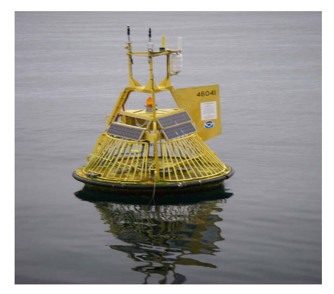
Figure 5 NDBC WxOP buoy vandalism: theft