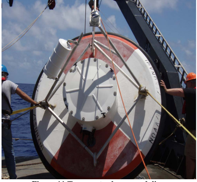
Figure 11 Tsunameter buoy vandalism: structure damage