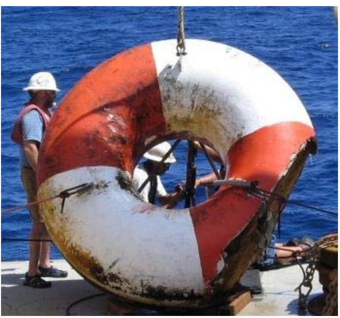
Figure 6 TAO buoy hull damage due to vessel collision

(5) the vessel sets nets to catch the fish following the buoys. We frequently find buoys with hawsers attached to the buoys, which is an indication of a sling shot. This method places a tremendous amount of stress on the buoy mooring line and anchor system. These actions will either damage instruments and equipment or rip the buoy from its mooring and make it go adrift. Through satellite tracking of buoy movement patterns, NDBC has sufficient data to conclude that the buoys are damaged after being used in this manner. Figure 9 shows a TAO buoy being repaired by a technician. Note the thick tug line on the buoy hull was not NDBC's line but was a line used by fishermen to apply the "sling shot" method.