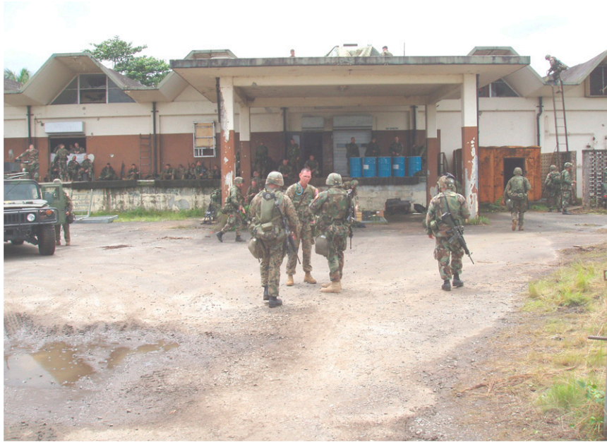
FIGURE 1. Warehouse that housed U.S. Marines at Roberts Interactional Airport in Monrovia, Liberia demonstrating numerous risk factors for contracting an arthropod-borne illness including broken windows, persons sleeping on the roof, standing water, and tall grass in the surrounding area, for contracting an arthropod-borne illness. This figure appears in color at www.ajtmh.org .

The broad differential diagnosis of a febrile illness in these individuals was narrowed when shipboard physicians identified P. falciparum in peripheral blood smears of several Marines. Considering the limited diagnostic resources available to rapidly evaluate a large number of patients, the remainder of the febrile Marines were presumed to have malaria and empirically treated with oral quinine sulfate and doxycycline until supplies of atovaquone/proguanil could be flown to the ship (Figure 2). However, the possibility of other febrile diseases associated