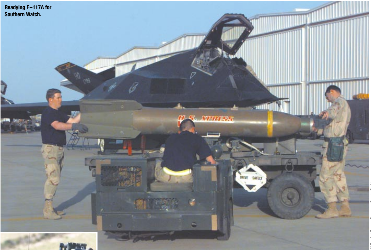
Readying F-117A for Southern Watch.