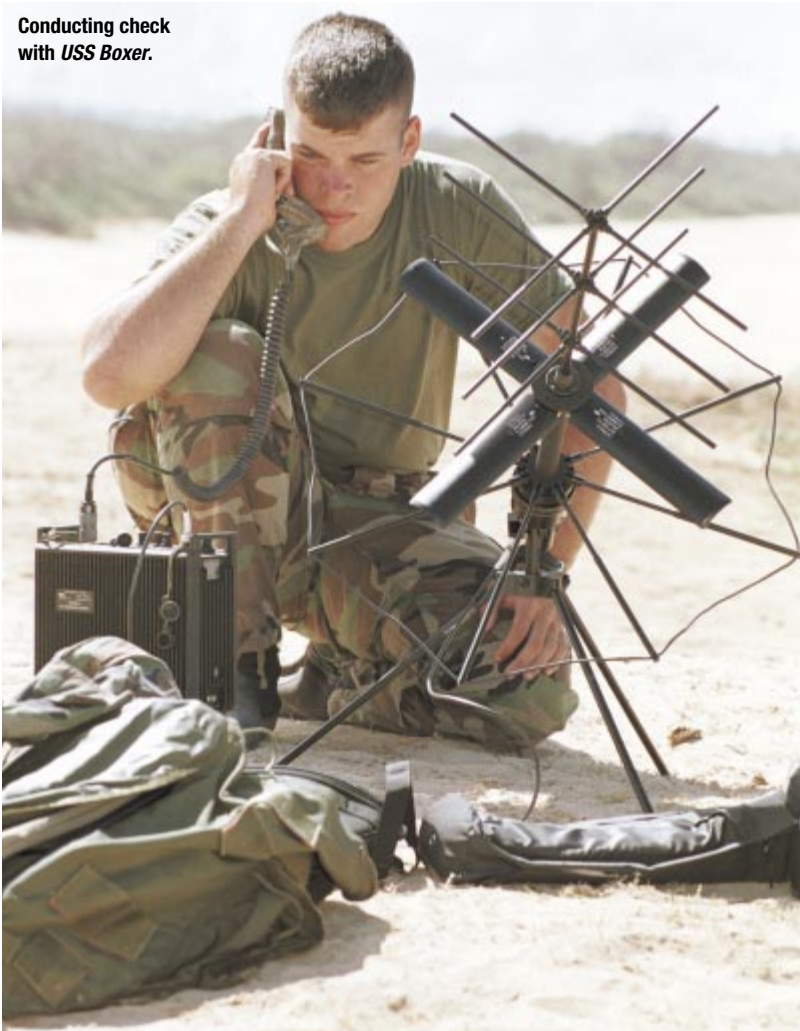
Conducting check with USS Boxer.