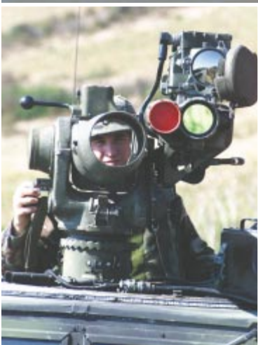
Looking through TOW missile launcher.