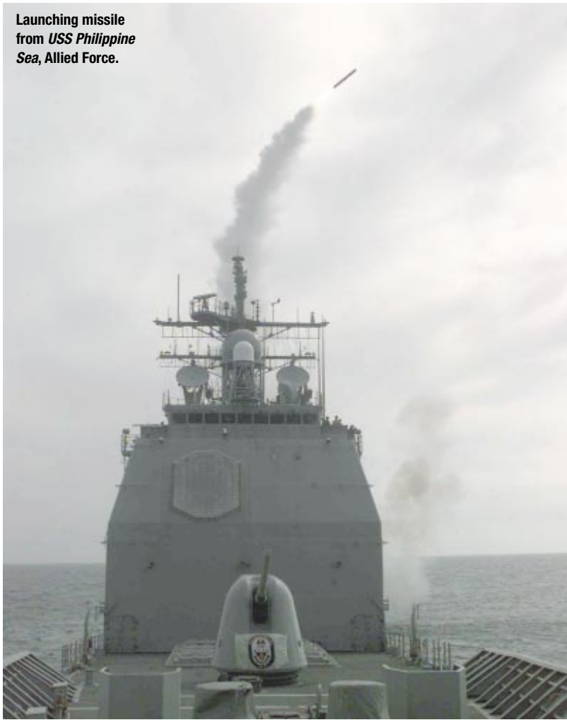
Launching missile from USS Philippine Sea , Allied Force.