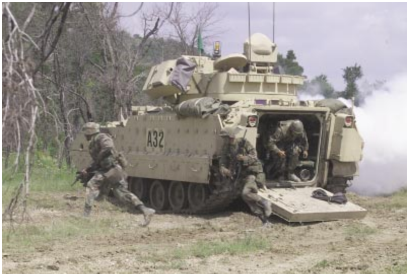
Fort Hood TSC-EIDC