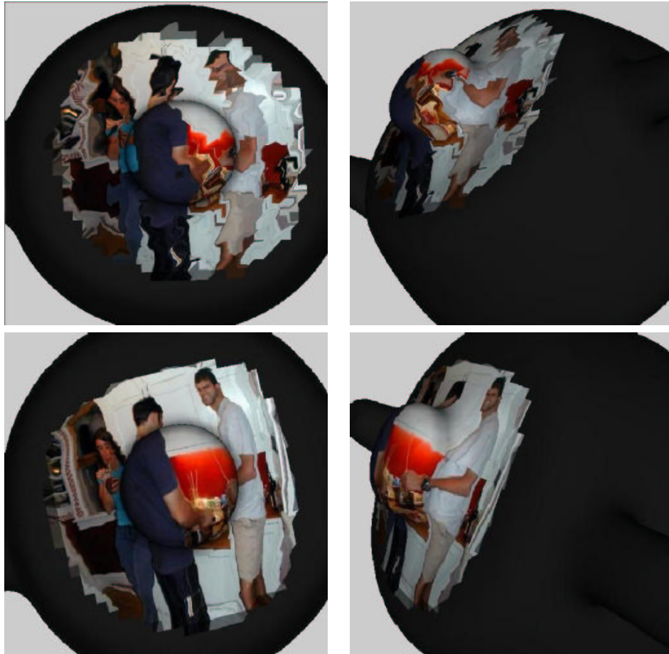
Figure 2: Diffusion of a noisy texture map onto an implicit teapot. We show two different views (noisy on the top and regularized on the bottom). ( This is a color figure. )