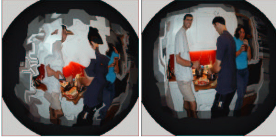
Figure 1: Diffusion of a noisy texture map (left) onto an implicit sphere (right). ( This is a color figure. )

In all the steps just described there are some minor implementation details, mainly regarding interpolation tasks, that we omit for the sake of clarity.