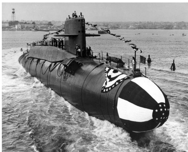
USS George Washington , the Navy's first nuclear-powered fleet ballistic-missile submarine, was commissioned in 1959.

often requires large-scale, complex manufacturing capabilities. Because the transitions from one stage to the next are often fraught with problems, many technologies ultimately perish in what has come to be known, especially in relation to the transition between the demonstration and deployment phases, as the “Valley of Death.”