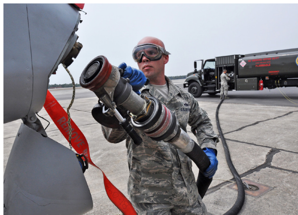
On 25 March 2010, the Air Force fueled and flew this A-10C Thunderbolt II with a 50/50 blend of bio-derived and conventional jet fuel, making it the first military or civilian aircraft to fly with biofuels powering each engine.

cles, acquiring 4,000 neighborhood electric vehicles in 2009; the Army also plans to deploy smart grids on tactical command posts and forward operating bases within five years [36].