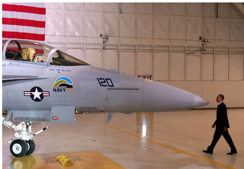
President Obama at Andrews Air Force Base, Maryland, on March 31, 2010, with the U.S. Navy's Green Hornet F/A-18, the first Navy fighter plane to fly on a biofuels blend.

tor, the demand signals are clear and the opportunities are enormous; this is true not only because of the signaled interest but also because of the sheer size of the organization. Consider this: DOD uses nearly 1 percent of all energy consumed in the United States, making it the nation's largest single user of energy; its share accounts for approximately three-quarters of all energy consumed by the U.S. government [37]. So, by focusing on improving its energy posture, DOD can begin the push toward a clean energy economy.