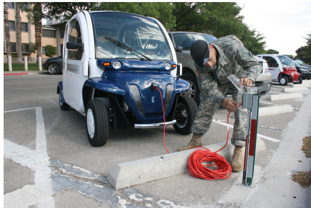
Fort Bliss' command sergeant major's electric car being charged on base.

Recent actions by DOD and the military services confirm their dedication to changing how they use energy. Operationally, the deployment of foam insulation on tents in Afghanistan and Iraq has resulted in significant reductions in the diesel fuel burned by power generators for air conditioning [32]. The Navy and Air Force have both demonstrated jets that use new blends of biofuels [33, 34]. By 2016, the Navy hopes to deploy the “Great Green Fleet,” an aircraft carrier strike group powered entirely by nuclear and biofuels [35]. The Marine Corps has mobilized Marine Energy Assessment Teams to analyze energy and water use on forward operating bases, and the Marines are also exploring potential solutions at experimental forward operating bases at Quantico, Camp Pendleton, and Twenty-Nine Palms. The Army is a leader in pursuing alternatives to traditional non-tactical fleet vehi-