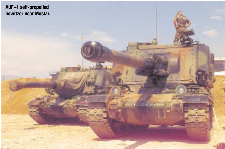
AUF-1 self-propelled howitzer near Mostar.