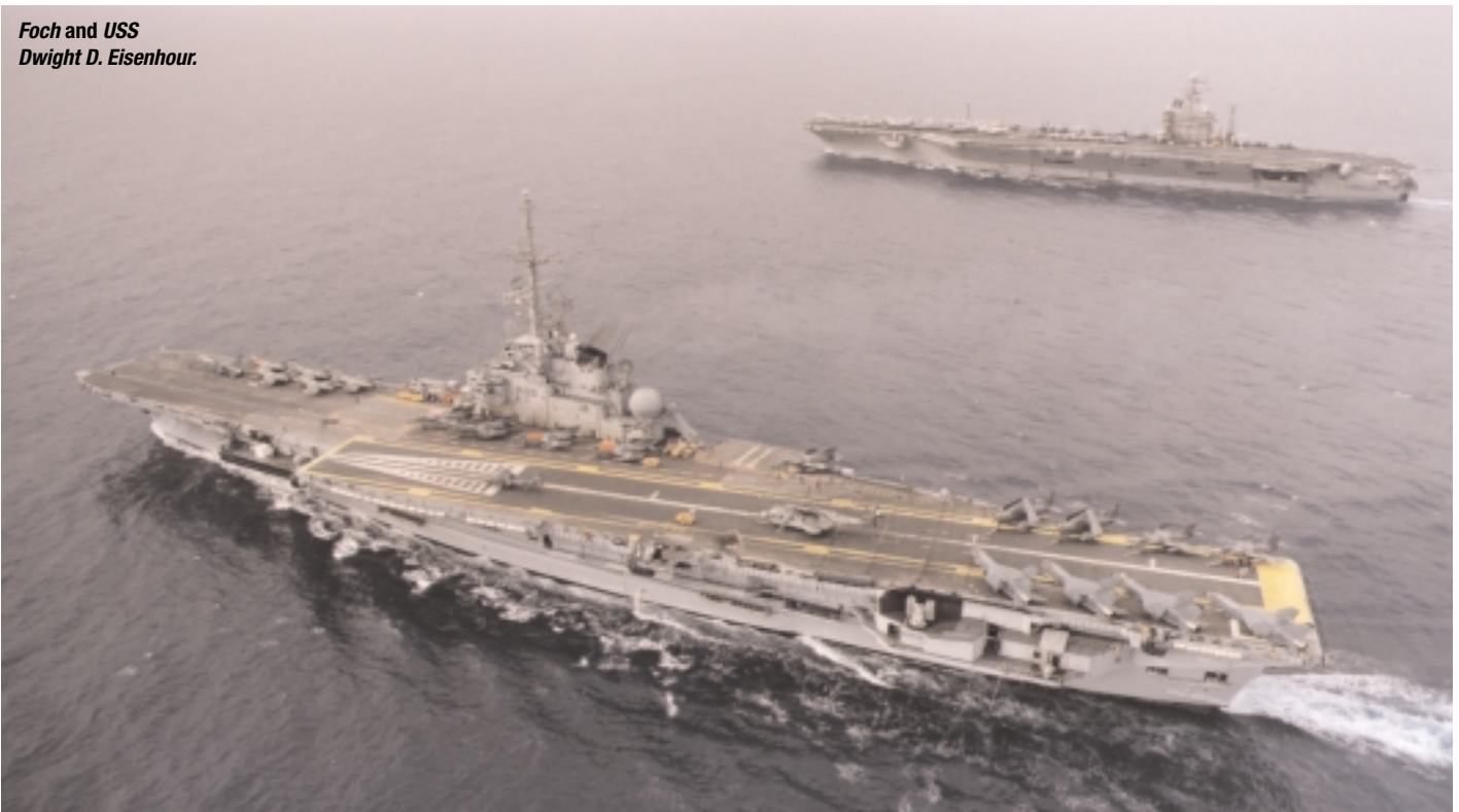
Figure 3. Navy-to-Navy Exchange Program

Super Etendard pilot aboard Foch Arresting gear officer, Charles de Gaulle Instructor, French Naval Academy, Brest EOD diver, Cherbourg CDC officer, Duquesne , Toulon SEAL, Commando Hubert, Toulon Dauphin SAR helo pilot, Toulon E-2C NFO, Lorient