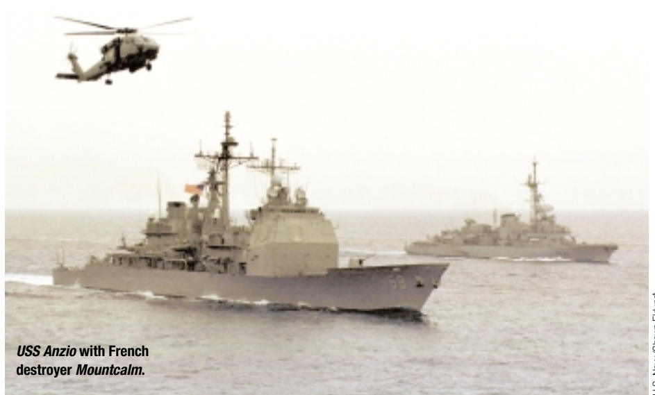
USS Anzio with French destroyer Mountcalm.

Although exercises like Red Flag can be critical in gauging progress in training and testing new tactical ideas, the best indicator of how effectively air forces operate together is a real crisis. The French have flown alongside the United States in Operation Southern Watch, in the skies over Bosnia, and in Kosovo. They have furnished 800 of the 1,800 troops to the Kosovo Reaction Force prepared to evacuate observers. French personnel took a principal role in leading an Alliance operation for the first time since leaving the integrated command structure. The air force deployed six C-130s, two C-160s, and a DC-8 to move supplies necessary to establish operations in Skopje and to deliver humanitarian aid to Albania and Macedonia. More resources are sustaining ground operations in Kosovo. Throughout the NATO air operations, the French were the second largest contributor, with over 100 dedicated aircraft. Their reconnaissance assets included Crecerelles and CL-289 drones as well as Cougar Horizon helicopters, which operated in concert with the joint surveillance and target attack radar system (JSTARS).