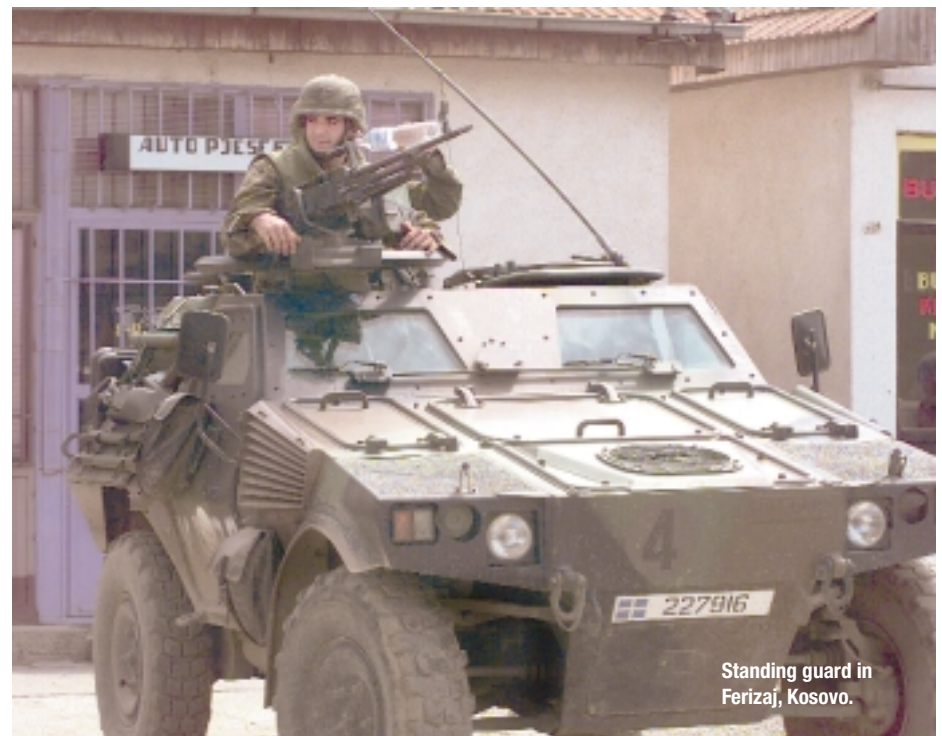
Standing guard in Ferizaj, Kosovo.

The army has reorganized according to principles of modularity and