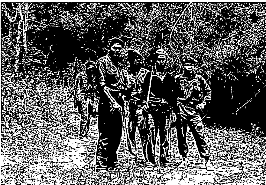
Team leader debriefing patrol returning from the Mu Gia Pass area

For the remainder of 1963, the Laos program, including my project, made significant progress and prospects were bright for 1964. Attitudes were positive and our confidence was high. The original game plan of organizing small, well-trained mobile units for use in hit-and-run operations designed to harass and tie up VC units was only then starting to shift incrementally toward more ambitious tactics aimed at actually seizing and holding ground. Few saw any potential dangers. We were certain that our actions would cause setbacks for the VC. In Washington, President Johnson increased overall US support for South Vietnam. Both in Washington and in Southeast Asia, despite ceaseless political machinations in Saigon and Vientiane, Americans continued to view the situation through rose-colored glasses. That a superpower could be tied down and ultimately rendered impotent in its conflict with North Vietnam was