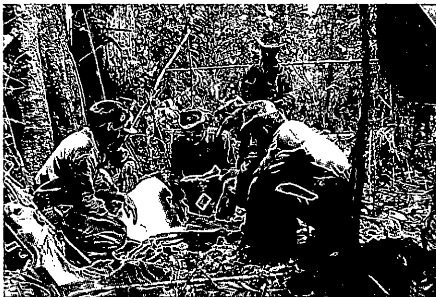
Road-watching team selecting observation site in the eastern Panhandle.

To improve my access, I traveled to Mukdahan, the Thai town across the Mekong from Savannakhet, for meetings with two team leaders operating in the southern Panhandle. As constraints eased, I slipped into Laos at night for additional