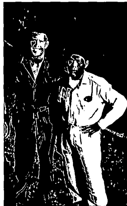
Author at Phou Song, with the Hmong village leader

In retrospect, a greater understanding of what was going on in Laos might have enabled us to work more effectively and perhaps would have spared some of the pain that the country experienced. We knew about the corruption, but few Americans wanted to take on the job of trying to control it. I was fully involved in our program and considered our effort as something apart from the mess in the capital. We saw