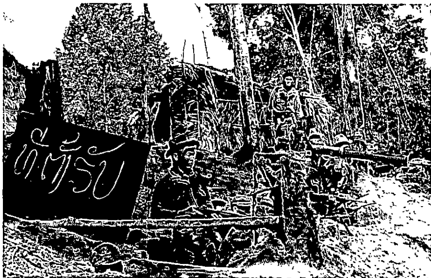
Perimeter outpost at Ban Na.

Each site afforded a good view of a portion of the western section of the plain. The PDJ is a prominent, and unusual, geographic feature in north Laos. The plateau was so named by