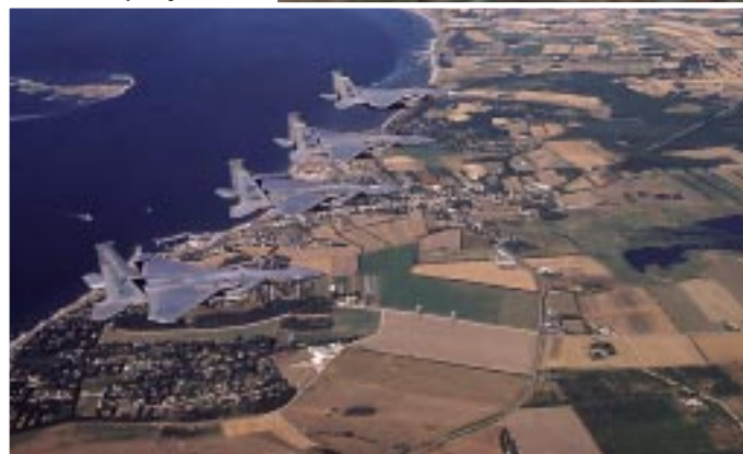
F-15s over Denmark, Tactical Weaponry '95.