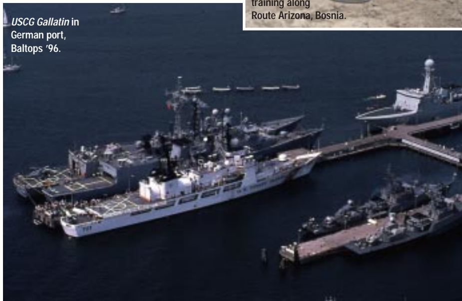
USCG Gallatin in German port, Baltops '96.