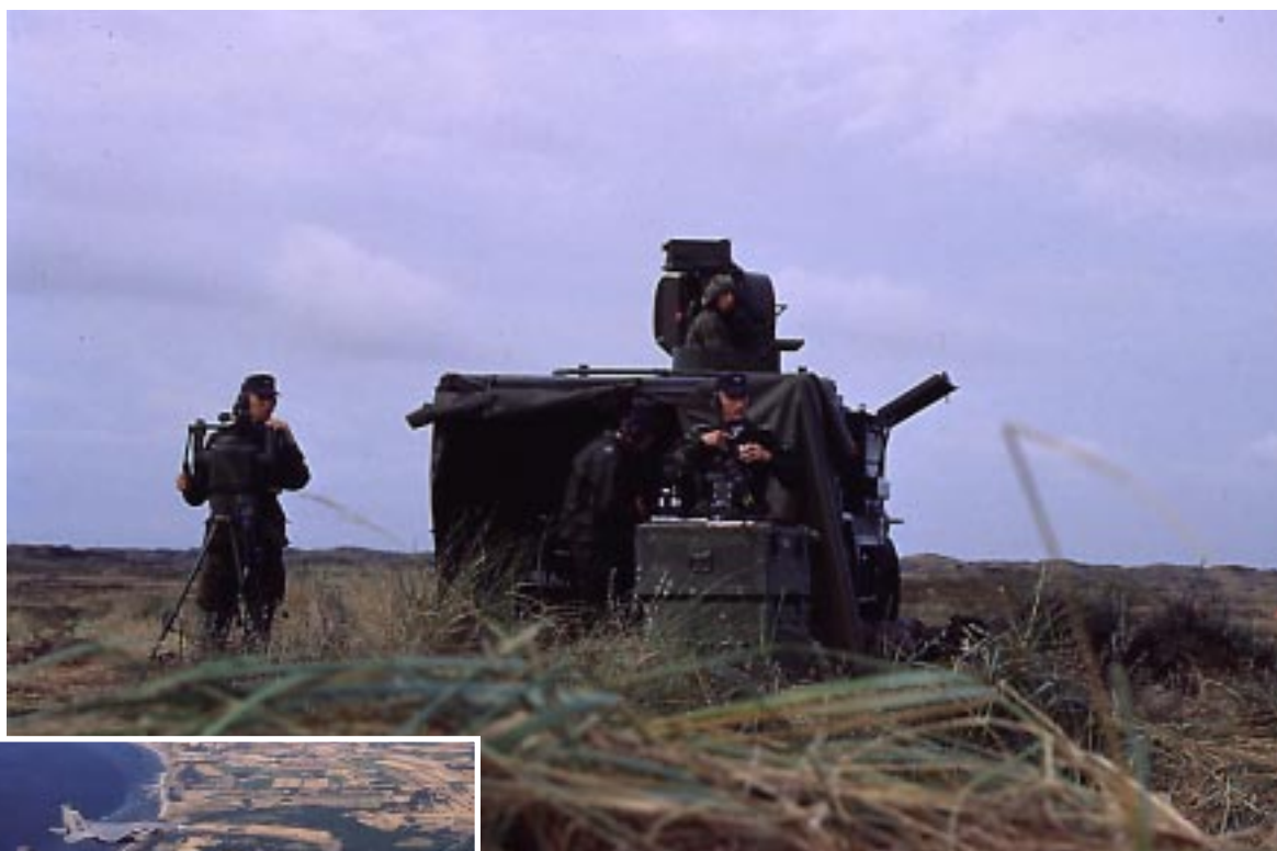
F-15s over Denmark, Tactical Weaponry '95.