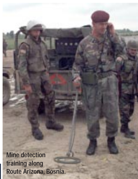
Mine detection training along Route Arizona, Bosnia.