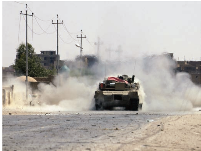
An U.S. Army M1A1 Abrams tank of 1/5 Cavalry used its 120mm main gun to respond to an attack by militia during a routine patrol in Wadi al-Salam Cemetery.

The remaining Army tank commanders agreed that the tragedy resulted from too few Marines accompanying the armored vehicles to protect them. Thereafter, Marine rifle platoons helped provide 360-degree security around the tanks and tracks as the vehicles pursued their missions. The adjustments worked well, as no other such incidents occurred for the remainder for the battle period. Company C's platoon leader, Lieutenant Sellars, believed that the militiamen pushed into the Old City to escape