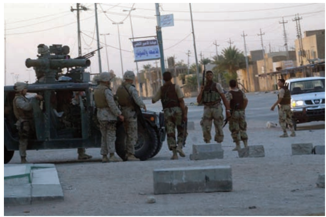
Marines and Iraqi National Guard soldiers set up a checkpoint using a Humvee equipped with TOW guided missile and machine gun.

While al-Sadr stalled peace negotiations, the Coalition continued planning for its final assault. Augmentation neared completion as multiple units gathered and staged at various forward operating bases. There they awaited for orders to deploy. The only real delay came from indecision over which direction to begin the assault on the Imam Ali Mosque. Planners favored an attack from