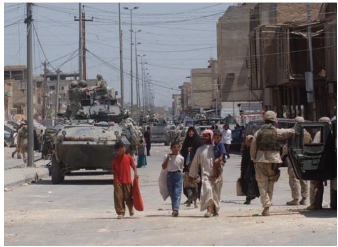
Marines with Company C, BLT 1/4, keep watch to ensure the safety of civilians in an-Najaf, Iraq.

The battle's conclusion placed a new face on Najaf and Kufa. With the truce, the 11th MEU shifted from combat to security and stability operations, the unit's originally assigned mission. This phase of the operation moved along with remarkable efficiency. BLT 1/4 Marines altered their activities to manning traffic control points in order to search for weapons and to control traffic flow. As far as people's activities and human relations were concerned, the only physical evidence of the battle was that it was easy to tell the former militiamen on the streets. Instead of their black uniforms, they now wore street clothes as well as scowls and stares of hatred directed at the Marines. 208 This challenge with identity continued as the Marines found themselves immediately engaged in reconstruction projects in an attempt to win the good will of the people of Najaf, so badly affected by the battle.