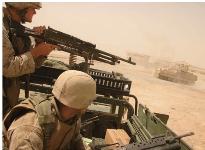
Marines from BLT 1/4 begin their patrolling of an-Najaf, which led to the confrontation with al-Sadr's militia during the Borneo patrol.

As the small convoy moved on, more fighters appeared carrying rifles and rockets. The 28 May truce forbade the militia from possessing such weapons, but plans for disarming the militiamen had never developed. The routine orientation patrol had inadvertently driven by al-Sadr's house and a women's maternity hospital, locales that the militia considered off limits to Coalition presence. Although these locations were technically not in the exclusion zone, Coalition forces had stayed out of