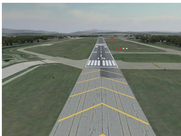
Figure 2 - Laptop Before DLL

display systems. These scenes were captured on a laptop.