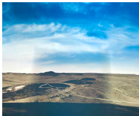
Figure 5 - JTAC Concatenated After DLL Applied to Center Channel