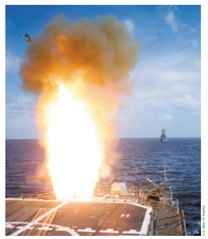
USS Hewitt firing SM-2 anti-missile rockets.

best shoot at a target. The effects of SIAP combine to increase the ability of commanders to rapidly shift air and missile defense resources and focus effects on an enemy.