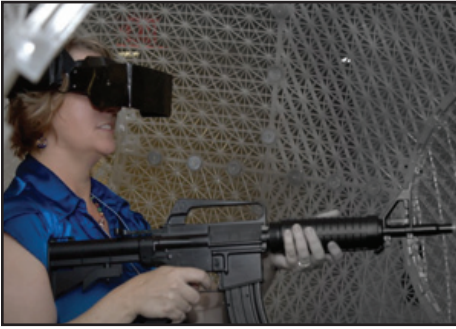
Conference attendee experiencing combat simulated in a virtual world

University's Science and Technology Department. This year's LEEF occurred 17-18 June, and was designed to explore the use of games, simulations and virtual worlds for learning. It looked at how tools can be successfully adopted, while addressing business and educational use objectives, design goals, and technical development needs. Demonstrating the effectiveness of games and simulations as an organizational learning strategy was the central theme of LEEF. This year's program also focused on how learning technology tools and corresponding techniques can be successfully integrated and implemented across learning organizations.