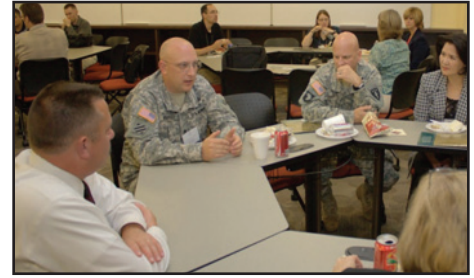
Members of the SEEG discuss possibilities of future technology use, with Harrisburg University of Science and Technology Alum

NexLearn (custom education courseware developer), JPL (developing innovative learning solutions to improve performance), Forio Business Simulations, IBM, Applied Research Associates (Virtual Heroes Division), Defense Acquisition University, Equipment Simulations LLC, Etcetera Edutainment, Inc., Tandem Learning, Novonics Corporation, Centrax Corporation, JPL, and Stockdale Center for Ethical Leadership, United States Naval Academy.