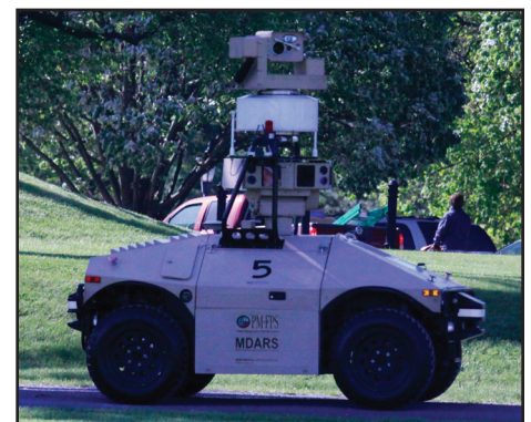
Mobile Detection Assessment and Response System (MDARS) designed to perform patrols

The objective of Robotics Day is to ensure Army War College students remain informed on what's going on in the field; therefore, this day is designed to increase their awareness of existing and emerging robotic technologies in support of the National Military Strategy. The Command, Control and Cyberspace Group of the Center for Strategic Leadership sponsored the 7th annual Robotics Day exhibition on 28 April 2010. With the excellent assistance and cooperation of Carlisle Barracks Garrison personnel, Indian Field and the front entrance area of Root Hall provided ample area to display and operate many of the finest and innovative remotely operated unmanned robotic systems supporting our military forces today. Good weather provided an appealing background