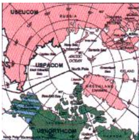
Figure 2 - Geographic Combatant Command boundaries.