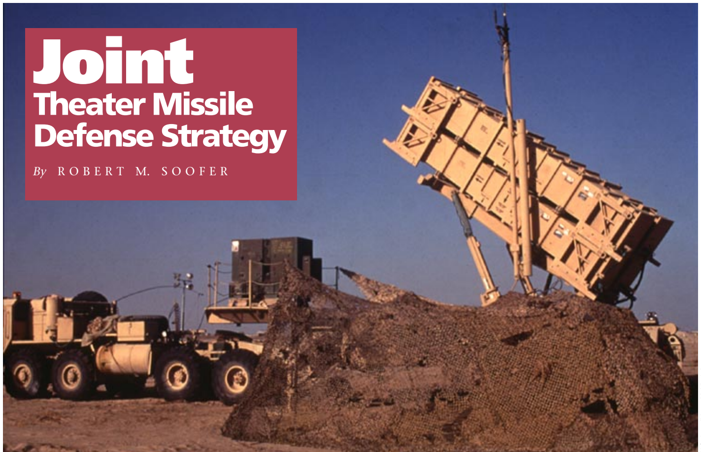
U.S. Army (Moses M. Maslo)