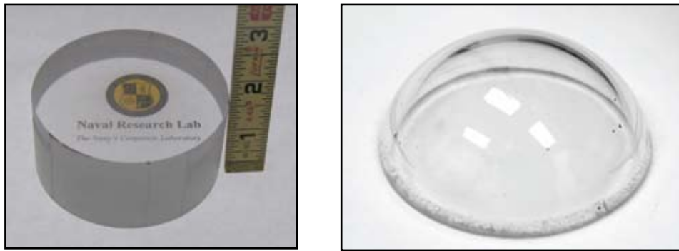
FIGURE 5 Examples of a thick (1.5-in.) spinel window and a dome.