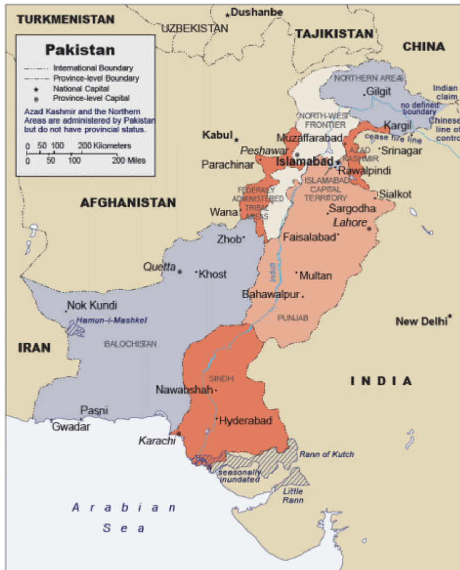
Figure 1. Map of Pakistan