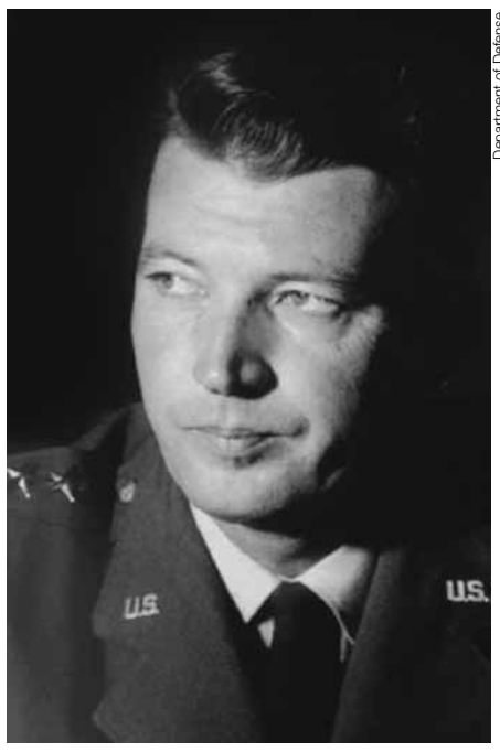
Gen Bernard Schriever worked outside staff structure to create Air Force ballistic missile and military space program

It is true that since 9/11, students have far more combat experience than in past years, but that experience is tactical and not strategic. It is based on demonstrated skill connected to a specific weapons system (for example, the F–15 or Distributed Ground Station) and to a lesser extent on leadership at the small unit level, but not on critical examination and participation in the development of national and operational strategy. We do