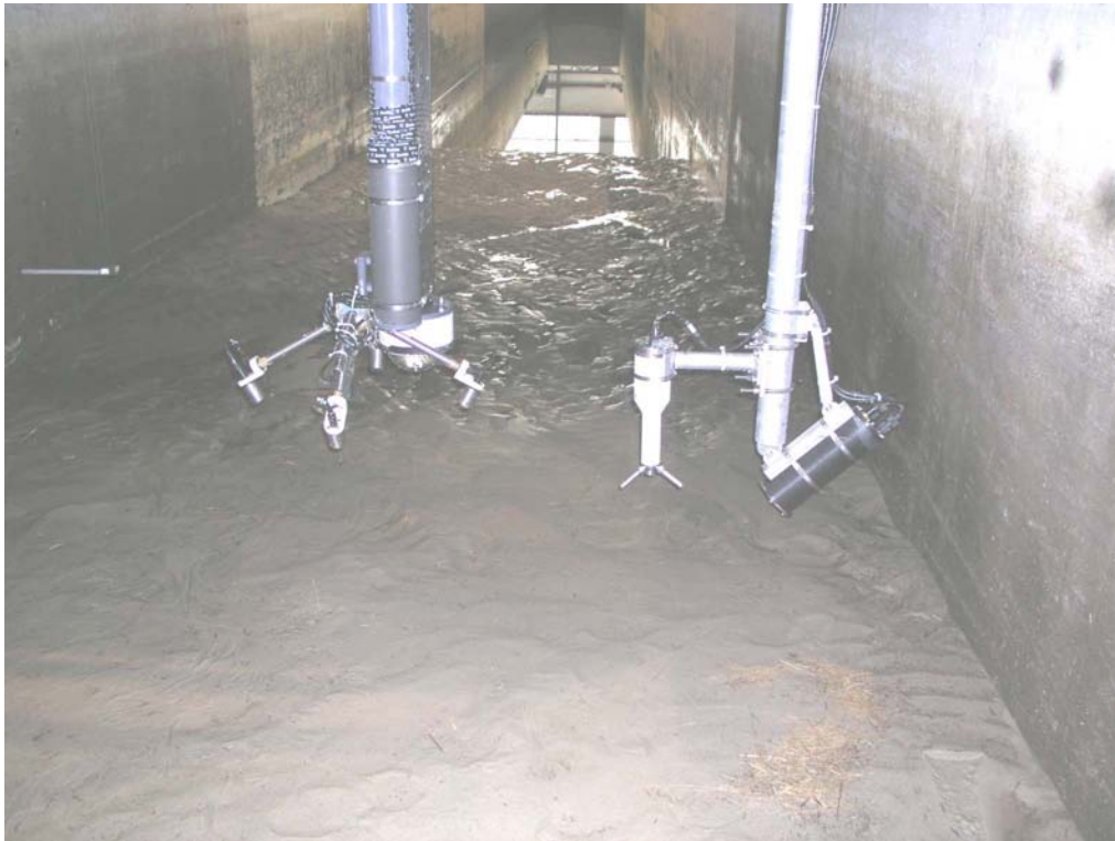
Figure 1. A view of deployed instruments looking down the sand beach (at “low tide”) within the OSU Large wave Flume during CROSSTEX. The left spar supported the 5 beam BCDV velocity and suspended sediment profiler, the acoustic scanned altimeter, and the scanned laser. The right spar suspended a reference ADV current sensor and camera that imaged the bedforms and scanned laser patterns.

Monterey Bay and Blacks Beach. Bedform maps were measured every 15 minutes using a scanned altimeter with 2cm horizontal and 0.2cm vertical resolution in a 1m square area surrounding the 0.8m high profile of 1cm binned 3 component velocity vectors measured by the BCDV. A 5 beam version of the BCDVSP, that provided additional symmetry in the stress calculations and redundant velocity component sampling, was deployed for a 3 week period in the OSU flume s during the CROSSTEX (figure 1). A new scanned laser imaging system was used to rapidly measure small scale bedforms and cross shore sediment suspension structure at 30 Hz rates and 2mm scales during this experiment (figure 2). The same 2 axis scanned laser also mapped small scale bed morphology to 2mm scales at a 0.5 Hz rate over a 0.5m square, capturing the 3D structure of suborbital ripple formation and transitions to sheet flow in higher forcing conditions.