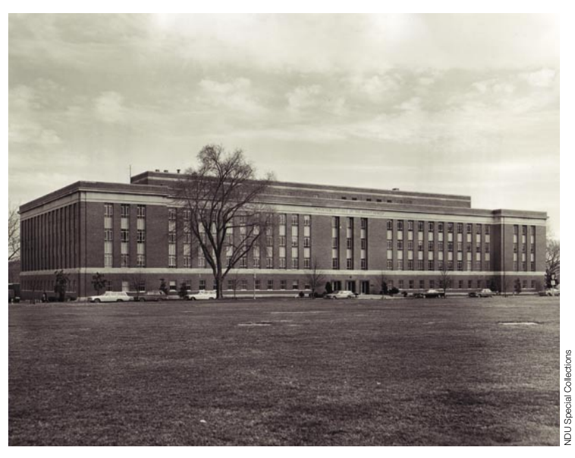
Industrial College of the Armed Forces, Fort Lesley J. McNair, 1964

Nothing was decided about these recommendations until broader issues were resolved: What should the postwar military look like? How joint should the military be? Should there continue to be separate services, and what should