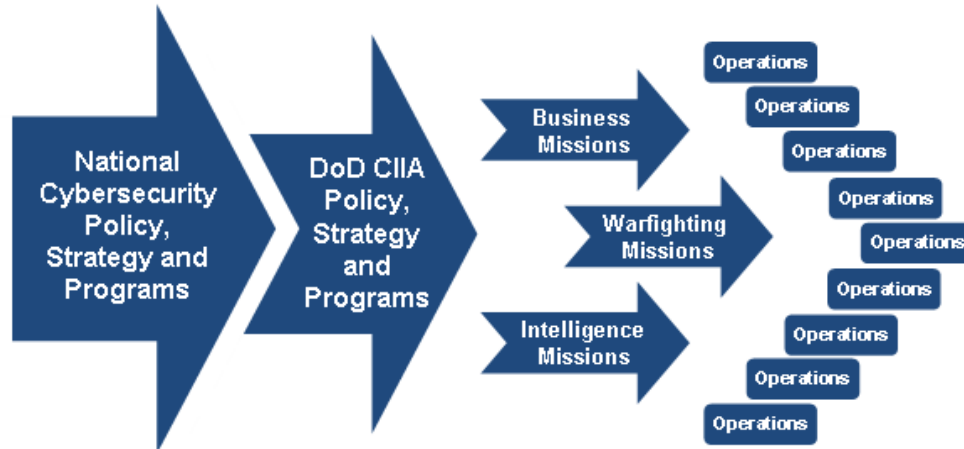
Figure 2. DoD CIIA Strategy Implements National Policy and Strategy and Supports all DoD Missions and Operations

Its contents should be referenced and incorporated into DoD Component and CPM) plans that impact CIIA capabilities. It updates and replaces the DoD 2004 Information Assurance Strategic Plan and all interim updates, and reinforces the critical contribution of the CIIA community in making DoD networks, information and information technologies secure, available, and sound for purpose. It implements national cybersecurity policy and strategy, helps shape National and global cybersecurity markets and technology pipelines, and it supports the full IM/IT life cycle across all defense business, intelligence and warfighting missions and operations, as illustrated in Figure 2.