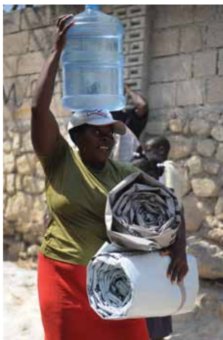
Earthquake survivors receive shelter packages containing shelter and water in Petit Place Cazeau, Port-au-Prince, Haiti, Feb. 23, 2010. The United States Agency for International Development distributed 500 shelter packages in support of Operation Unified Response. A 7.0 magnitude earthquake on Jan. 12th left thousands of Haitians displaced.