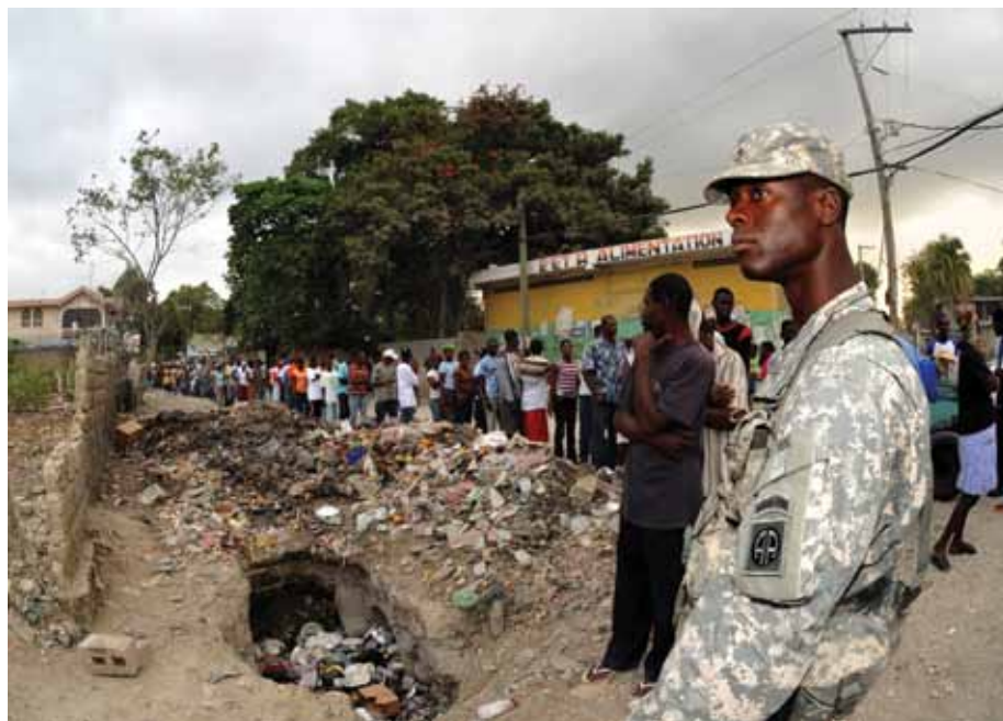
A U.S. Soldier from the 82nd Airborne provides security outside a relief distribution point in Port au Prince on Feb. 26, in the aftermath of the 7.0 earthquake that struck Haiti on Jan. 12.

NGOs bring many strengths to the table that can complement DoD’s heavy lift, logistics, trauma lifesaving abilities, and capability to work in hostile areas. NGOs conduct long-term capacity building in a diverse range of areas including water, sanitation, food, schools, and health which are strategically important for the country’s health ministry and what the local population wants and can support. “The NGO has local partnerships, a history in the area, and sustainability. All of the new guidances are saying if you create a program it has to be sustainable and the hand-off to the host nation or NGOs working with the host nation is appropriately done,” Dr. Lawry said.