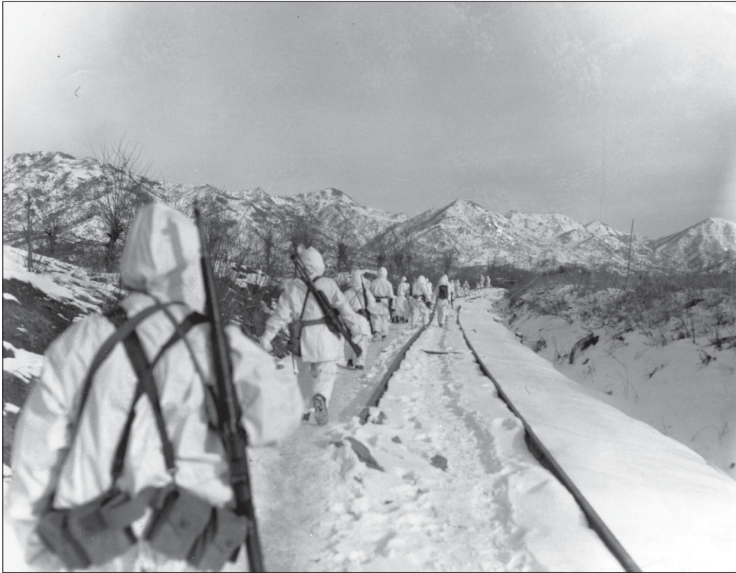
A squad from the 23d Infantry Regiment, 2D Infantry Division, moves out from bunker positions on patrol duty at Kumgangsan, Korea. Jan. 1952.

The Republic of Korea is one of the most densely populated countries on the planet. Combined with extreme mountainous terrain over 70% of the country, there is extreme competition for training land by both the civilian population and the ROK Army. 20 In the 2 ID area of operations there is only one major maneuver training area to which the U.S. has access. This is the Mu-Gun-Ri or Twin Bridges Training area (approximate usable area 8 Km by 4 Km), and the U.S. has access to that area for 13 weeks per year (increasing to 17 in 2005). 21 This is a minimal amount of land to train a heavy division, including its combat support and combat service support units. Despite the agreements, there is often encroachment on the training area from both civilians and ROK Army units. As a result, units coordinate on their own for additional training areas from the ROK Army. Without a formal ROK Army sponsor, unit efforts often fail, or gain permission for training facilities too late in the planning cycle to be used. A similar scenario occurs when agreed upon land is encroached by ROK Army units. It often takes most of a day to rectify the situation, as the complaint has to go up through the Eighth United States Army, over to the ROK Army and