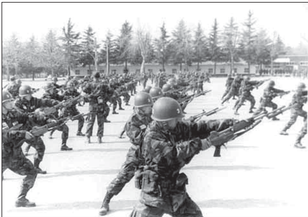
KATUSAs in training

The reliance on KATUSAs for translation purposes is also quite dangerous from an operational standpoint. Aside from the thirty translators described above, all the other soldiers perform duties that take the place of a U.S. soldier. Their talent and skill as a tank gunner or forward observer will be a lot more critical in combat situations than working in an operations section or as the company commander's translator.