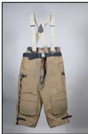
(a) Front view