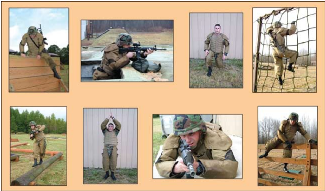
FIGURE 3 QuadGard testing by Army Research Laboratory at Aberdeen Test Center obstacle course and marksmanship range demonstrates the flexibility of the design and its compatibility with existing body armor and infantry equipment.