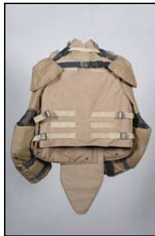
(b) Back view