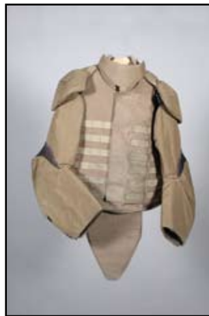
(a) Front view