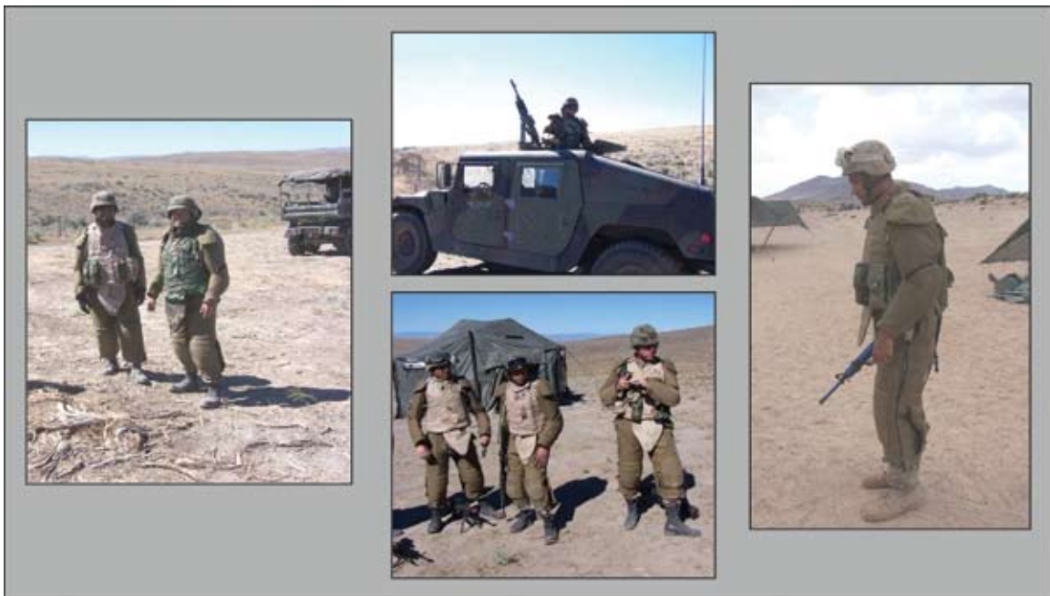
FIGURE 6 Testing and evaluation of QuadGard during training exercises by the Marine Corps at the Air/Ground Combat Center in Twentynine Palms, California.