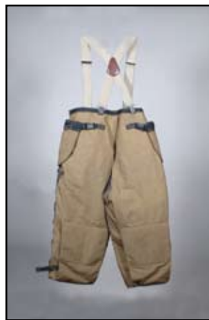
(b) Back view