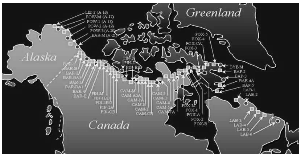
Figure 7. North Warning System Sites 60

The far north is in need of technological and material advancements, starting with surveillance capabilities. The semi-autonomous North Warning System (NWS) remains in place roughly along 68°N and the Labrador coast. (Figure 7) The sites were positioned to see approaching aircraft and missiles, but are in prime locations for monitoring the sea as well. The radar upgrades installed in the early 1980s were a significant improvement over original DEW line equipment, but these are aging and warrant modernization and further automation. The platforms are the logical place to begin housing sea surveillance radars, navigational aid monitors, and distress call triangulation capabilities to supplement the limited satellite tracking in the far north. Upgrades must enhance the ability to monitor the sea as well as the air and space approaches to the continent.