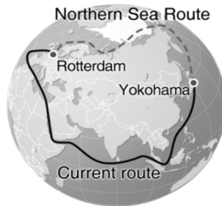
Figure 4. Shipping Route Comparison 10

Yokohama to Rotterdam is 5,000 miles, and up to 7 days, shorter using the NEP rather than traditional routes. 8 (Figure 4) Reduced transit time was the driving factor behind the latest milestone in trans-Arctic shipping. Two German cargo vessels made the first unaccompanied commercial shipping transit of the Arctic through the NEP last summer. 9