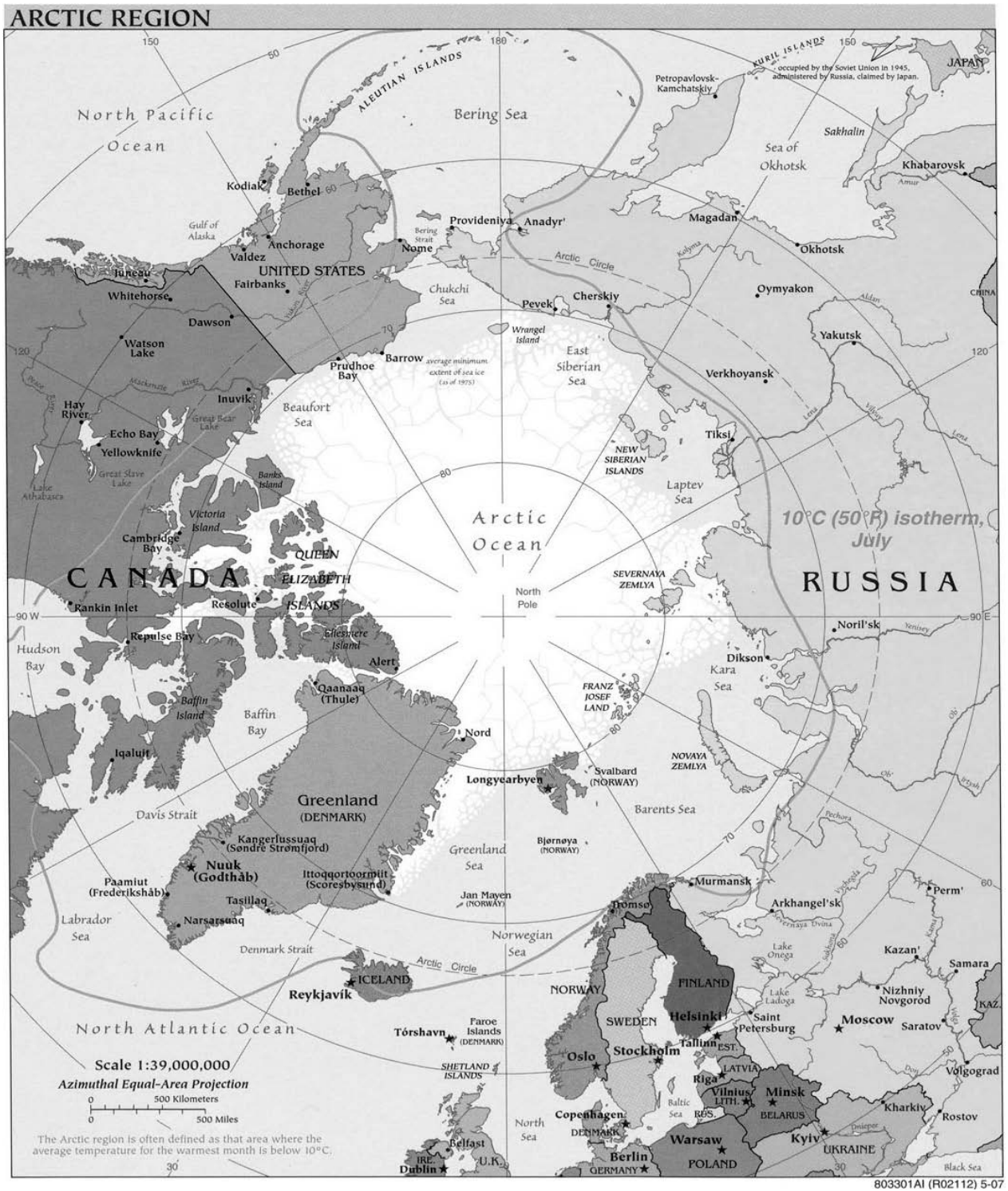
Figure 1. The Arctic Region 2

for NORAD and U.S. forces stationed in the far north need to adapt to ensure the protection of evolving, shared security interests.