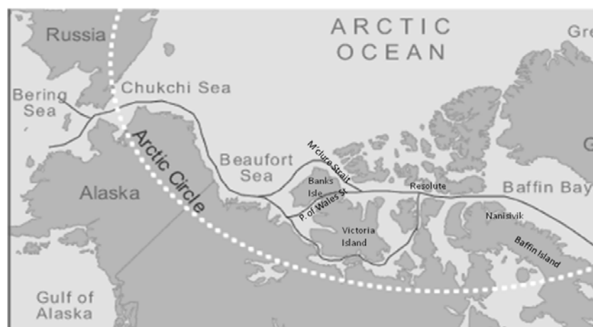
Figure 2. Northwest Passage Routes 3

In 1957 the U.S. Coast Guard icebreakers Storis , Bramble and Spar completed the first successful deep-water transit of the Northwest Passage. Researchers concluded there were two possible NWP routes for deep draft ships. The simplest was planned along the length of the Parry Channel, but multi-year ice blocked M'Clure Strait on the Channel's western edge. The three ships shifted to the second route, transiting the narrower Prince of Wales Strait around the southern edge of Banks Island. Another course south of Victoria Island, along mainland Canada, is farther south but the waterway is much shallower and littered with small islands. The two northern variants are the primary avenues for growth in international shipping.