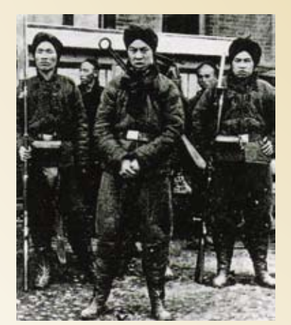
Soldiers of the Boxer Rebellion

All of this suggests why Fairbank, for instance, has described "the chief problem of China's foreign relations" as having been "how to square theory with fact, the ideological claim [to supremacy] with the actual practice"—which could vary considerably.<sup>49</sup> The Sinocentric world order may have been "a myth backed up at different times by realities of varying degree, sometimes approaching nil,"<sup>50</sup> but it was a myth that was critical to the legitimacy of the entire Imperial system and indeed the very foundations of Confucian society. It was a recurring