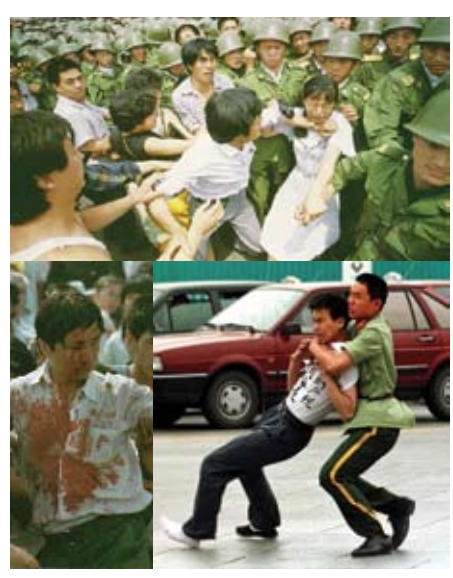
(Top) Demonstrators on front line attempt to stop 5,000 PLA soldiers from entering Tiananmen Square; (bottom left) Demonstrator injured during clash with police outside Great Hall of the People; Policeman tackles protester during 10<sup>th</sup> anniversary of Tiananmen Square confrontation

A key question for observers pondering the future, then, is how the shock of plural sovereignty has affected China's view of itself and its conception of world order. It had been taken as axiomatic for millennia that the key to peace and plenty in China was unity and that disunity produces only "civil war, insecurity, and disaster for elite and commoners alike."61 Just as Confucian ethics "required cultural unity as an essential ground of a civilized political-social unity,"62 so the proper ordering of the peoples of the world required a political unity-or at least a recognized gradient of power and virtue that reaffirmed the centrality of the Middle Kingdom. Legitimacy and socio-moral superiority were indissolubly linked. As Chinese writings on geopolitical strategy echo even today, the "great mission under heaven was to turn chaos into unity," and the "basic trend of Chinese history" was toward unification.63 And yet here came