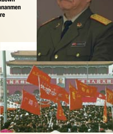
Demonstrators on front line attempt to stop 5,000 PLA soldiers from entering Tiananmen Square

Defense Minister General Chi Hoatian, who led military crackdown in Tiananmen Square