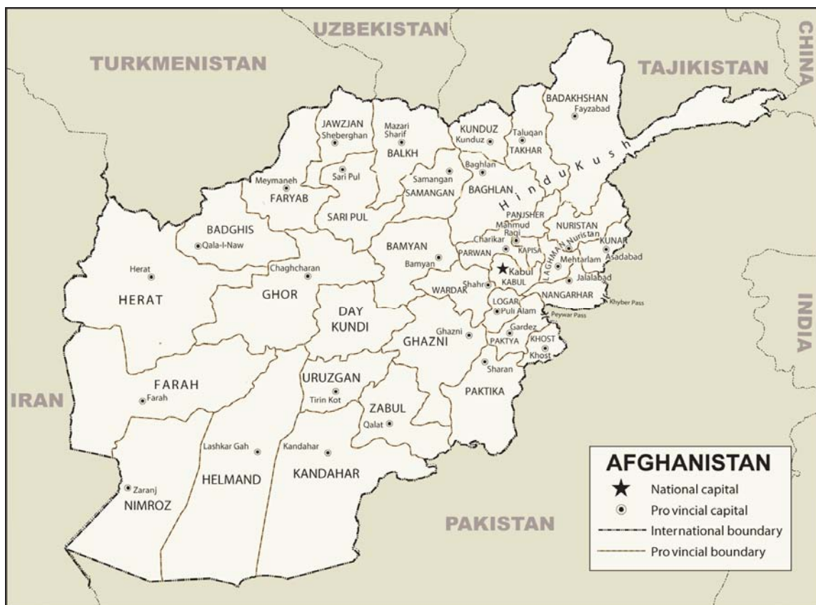
Figure A-1. Map of Afghanistan