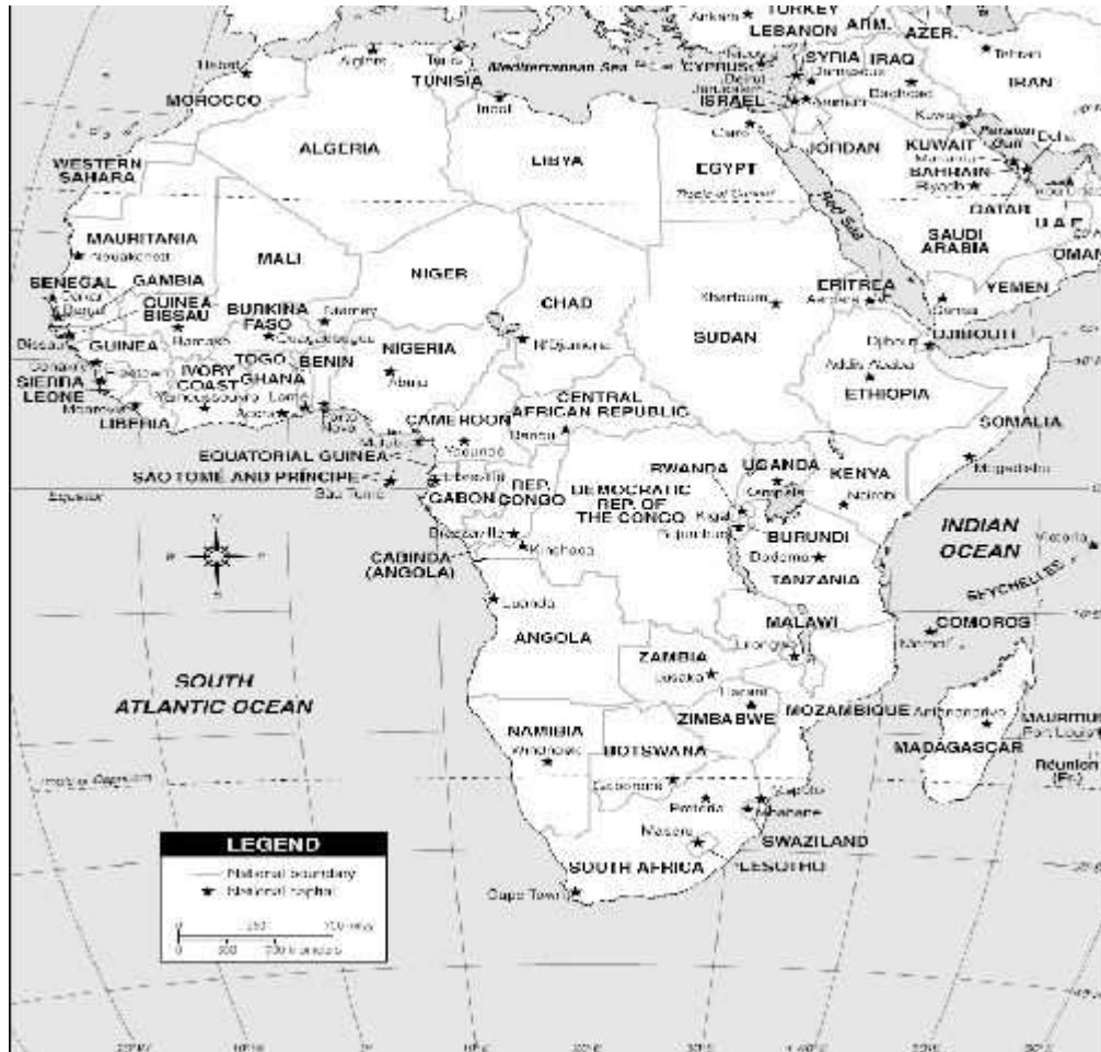
Figure 1: Map of the Gulf of Guinea

sub-region. Maritime security relates to prevention of unlawful acts in the maritime domain, whether they directly impact the country or region in question, or the perpetrators are in transit. Some of the main threats and vulnerabilities in the Gulf of Guinea are discussed below.