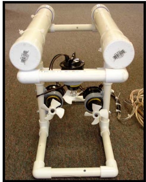
Fig 3 three thrusters give the ROV mobility forward, back, left, right, up & down

A range of audiences have been introduced to "ROVs in a Bucket" through formal and informal education programs involving a diverse demographic and range of ages down to thirteen years (Fig 5, 6 7). In addition to presenting this through formal grade school (8 -12) programs, it has been effectively delivered informally, to pre-service teachers (undergraduates), certified school teachers, and executives seeking to improve team-skills in the workplace. Recently the program was introduced to a troubled inner-city school system. They subsequently participated in the 2 nd annual Mid-Atlantic MATE ROV competition.