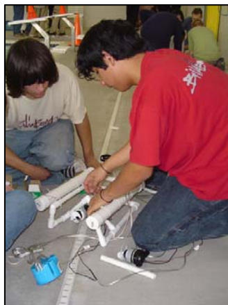
Fig 6 Building an ROV