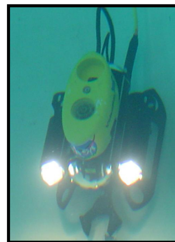
Fig 2 Video Ray used at workshops by participants

Propulsion: With three strategically placed motors the ROV can move in any direction (Fig.3). Two motors are installed facing the front of the ROV, one on the port side and the other on the starboard side. If both are powered in the same direction at the same time the ROV will move forward. If the polarity of the motors is reversed, the ROV will move backwards. To make the ROV turn left, the starboard motor is pushed forward, and the port motor reversed. The asymmetry of the motor movement causes the ROV to turn left. If a right turn is needed, the left motor will be pushed forward and the starboard motor back. The up and down movement is effected by a motor that is positioned vertically on the ROV frame. With the ROV slightly positively buoyant, when power is applied in the “down” direction, this thruster will cause the ROV to dive. When power to this thruster is placed in the “up” position, the ROV will return to the surface (with the aid of buoyancy).