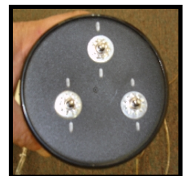
Fig 4 The Controller Switch Arrangement.