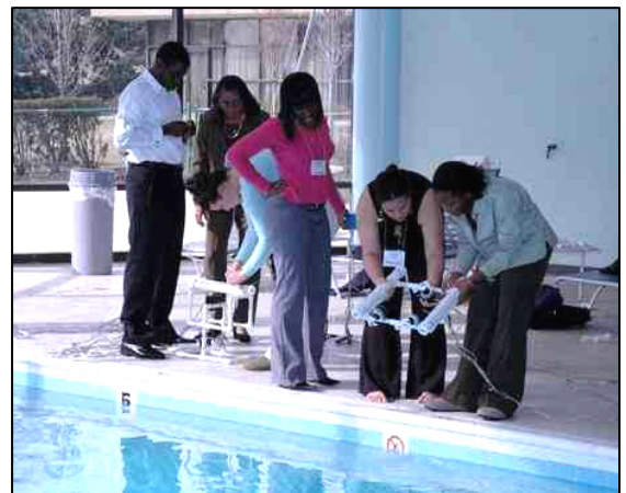
Fig 7 Launching ROVs