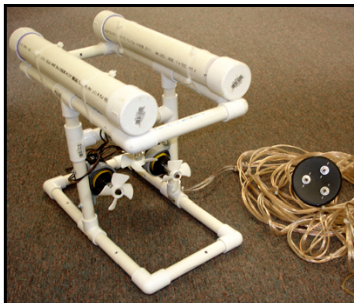
Fig. 1 The Program ROV, 10m Tether, and controller

The “Intro to ROVs” is more than a cursory introduction to the mechanical attributes of an underwater robot. It includes links to possible career paths (in NOAA), how ROVs are used in the Oil Industry, and how Sanctuaries may use them to assist with habitat mapping, among others.