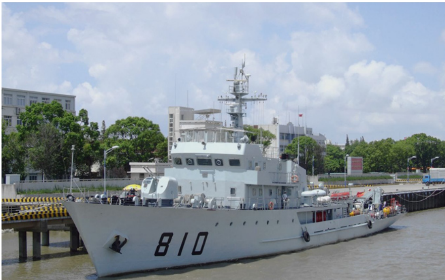
Photo 1. Wochi-Class Mine Countermeasures Ship. Jane’s Fighting Ships lists six of these, which are apparently built at two shipyards, and mentions that they are similar to, but five meters longer than, the older T-43 Soviet-designed minesweepers that China built previously.

It would be a mistake to dismiss PLAN minesweeper development, however. Qiuxin Shipyard is reported to have launched a “new class” of six-hundred-ton minesweepers on 20 April 2004. 71 A daily newspaper published by the political department of the PLA’s Guangzhou Military Region reports that in 2005 the PLAN made “achievements of development of training and operational methods for new equipment represented by new-type minesweepers.” 72 Since 2005 the PLAN has taken delivery of two new, indigenously built types of MCM vessels: six of the Wochi class, and an as-yet single-ton Wozang class. 73 Of particular interest, China Central Television’s military channel,