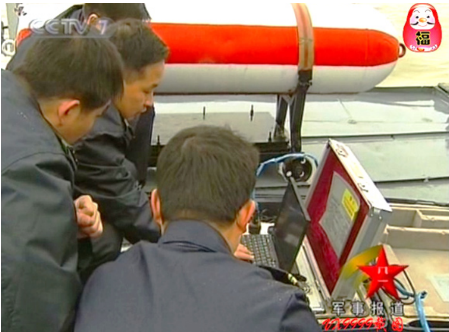
Photo 11. Exploiting Information Technology. Chinese technicians use a computer, with an exercise mine in the immediate background. Computers could greatly increase the accuracy of mine allocation, placement, and feature settings (such as activation delay, ship counters, and other variables), thereby optimizing their effectiveness.

mine technology in all aspects of their work, including monitoring inventories, repairing, and discarding obsolete weapons. 369 The PLAN Ordnance Support Department has issued and implemented further regulations such that “the time to rotate from one mine war-readiness level to another has been reduced.” 370 As of 2008, for one South Sea Fleet sea mine depot