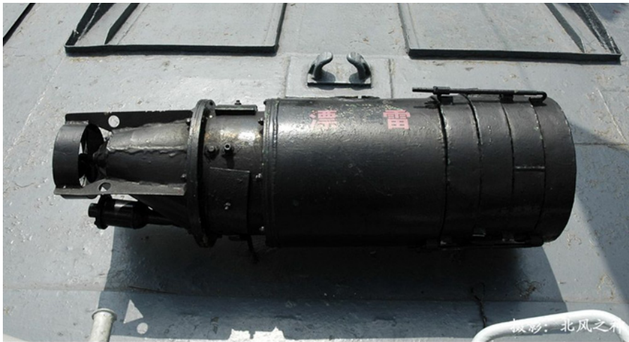
Photo 3. Piao Drifting Mine. The PLAN has produced large numbers of free-floating mines, although the current status of production, inventory, and deployment is unclear.

developed a third-generation drifting mine, the Piao-3, that oscillates at a depth of between two and seven meters. 87 Such drifting mines might be particularly useful for denying surface vessels access to waters east of Taiwan, particularly those too deep for rising mines.