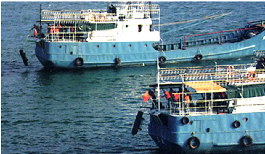
Photo 6. People's Militia Laying Mines. These two civilian fishing vessels, which are ubiquitous in the seas around China, practice deploying bottom mines as part of a larger "People's Militia" exercise at the PLAN base in Sanya in December 2004. Such exercises occur regularly at various PLAN bases. GPS would allow accurate placement of mines in defensive minefields around Chinese ports, even by militia forces such as these.

Complementing the robust capabilities described above are the thousands of Chinese fishing and merchant vessels that could be pressed into service. In 2003, Rong Senzhi, Deputy Commander, Yantai Garrison District, advocated in a journal affiliated with the Academy of Military Science that civilian vessels be utilized for minelaying and mine-sweeping. 213 China's 2008 defense white paper lists "mine-sweeping and mine-laying" as one of four primary PLA Navy Reserve forces. 214 According to one article, "China currently has 30,000 iron-hulled mechanized fishing trawlers (each vessel can carry 10 mines), and there are another 50,000 sail-fishing craft (each can carry 2–5 sea mines)." 215 Science of Campaigns (2006) is quite explicit on this point: "Mine-laying missions are usually assigned to submarine and aviation forces with relatively good concealment, but privately owned boats can also assume . . . mine-laying missions." 216 Chinese writings frequently mention the incorporation of civilian shipping into naval service for such