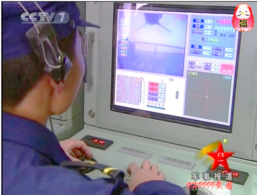
Photo 10. Console on Mine Countermeasures Ship. This operator's console, probably from Mine Countermeasures Ship 804, features a joystick and the ability to observe camera images remotely. It could be the location from which the mine-hunting UUV previously pictured is operated.

Some exercises have assumed “that ‘enemy vessels’ had mined a certain sea area to block our warships from passing.” 315 MCM and MIW assets seem to be virtually interchangeable, in that PLAN minesweepers regularly practice laying mines. 316 Minesweeper ship training has recently included “daytime deep water minesweeping,” “nighttime minesweeping,” and “passing through a composite minefield” for single ships. 317