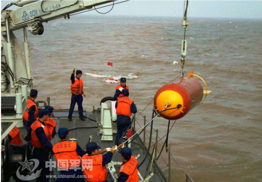
Photo 12. Minesweeping Exercise. Crewmembers on a PLAN East Sea Fleet mine countermeasures ship handle a towed noisemaker used to sweep acoustically triggered mines in May 2008. Already in the water is a marking buoy. Mine rails are visible on the deck to the right of the crane.

how the advent of GPS technologies could enhance the future effectiveness of MIW if this technology enables much more accurate laying of fields (or MIW operations by less experienced cadres), as well as the transmission of information on the parameters of those fields to friendly units. 385 Mentions of GPS-related training activities in PLAN reports, including MIW and MCM exercises at night and in bad weather, may indicate that this new technology could become a significant MIW enabler. 386 This may also be suggested by a minesweeper unit's development of a "recording instrument" that "raises the accuracy and battle operations capacity of sea mine sweeping and laying." 387