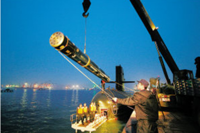
Photo 5. Submarine Mine. PMK-2 propelled mine being loaded onto Song-class diesel submarine at Qingdao.