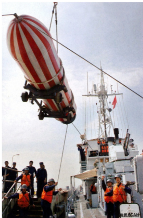
Photo 4. Laying a Training Bottom Mine. A crane, adequate deck space, GPS, and a low sea state are the conditions required to lay mines such as this bottom mine exercise shape.

simplicity of command and control. Disadvantages include a lack of stealth, limited speed, and consequent vulnerability. 186