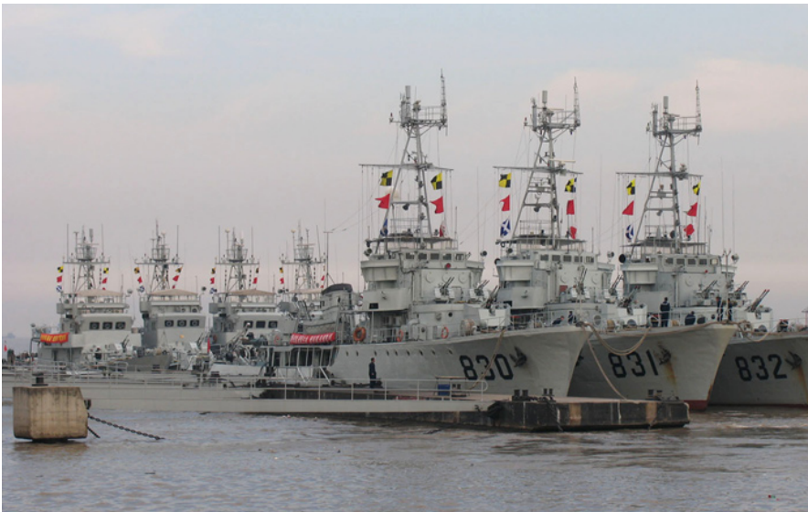
Photo 8. PLAN Minesweepers.

MIW is a major surface fleet mission. The PLAN has stressed speed, 277 automation and electronics, 278 and “all-weather” minelaying capabilities. 279 Jianghu-class frigates have conducted minelaying as part of ASW training. 280 Captains of minesweepers train at a special center at Lushun naval base. 281 Minesweeping units have recently practiced laying various types of moored and deep bottom mines as part of fast-paced, confrontational exercises. One South Sea Fleet minesweeping unit has recently participated in over ten such exercises, in which it “achieved 26 scientific research results” as part of a larger effort to keep abreast of a “new global revolution in military affairs” that includes “network-centric training” and “the intelligization of sea mines.” 282 Indeed, the PLAN apparently views minesweepers equipped with “torpedo” (mobile) mines as a viable ASW platform that illustrates the potential for “old equipment + networks + talent” to “thoroughly convince” those who believe that “it is not possible to establish a platform for informatized exercises on old equipment.” 283 In 2002, a North Sea Fleet unit including minesweepers 813 and 811 attacked submarines with “both foreign and domestic torpedo sea mines” with a “100% success rate.” 284 More recently, all three of China’s fleets have trained with what appear to be advanced mobile mines. In December 2005, North