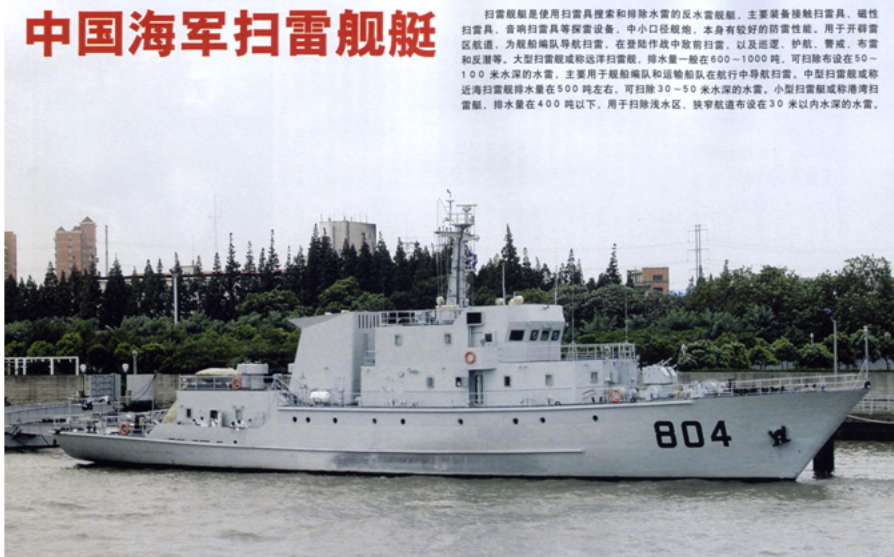
Photo 9. PLAN Mine Countermeasures Ship 804. This is one of China's most modern mine countermeasures ships. This ship has exercised with a remotely operated mine-hunting underwater unmanned vehicle and using what appear to be sophisticated, high-frequency active digital sonars.

operated mine-hunting underwater unmanned vehicle, described as a “new type of mine clearing device” and using what appear to be sophisticated, high-frequency, active digital sonars. 303