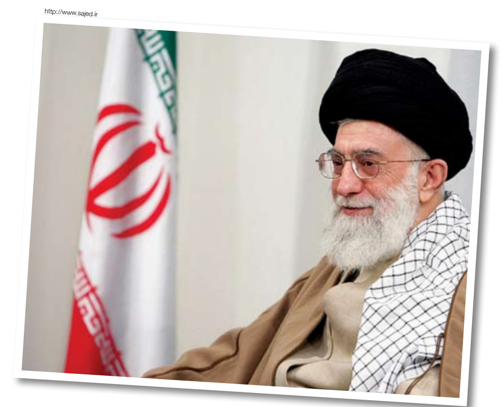
Grand Ayatollah Ali Khamenei, Supreme Leader of Islamic Republic of Iran

Some strategists point to Saddam Hussein's restraint in not firing biological and chemical weapons-tipped ballistic missiles at Israel during the 1991 Gulf War as evidence that nuclear deterrence is robust. The late national security expert Ze'ev Schiff put the