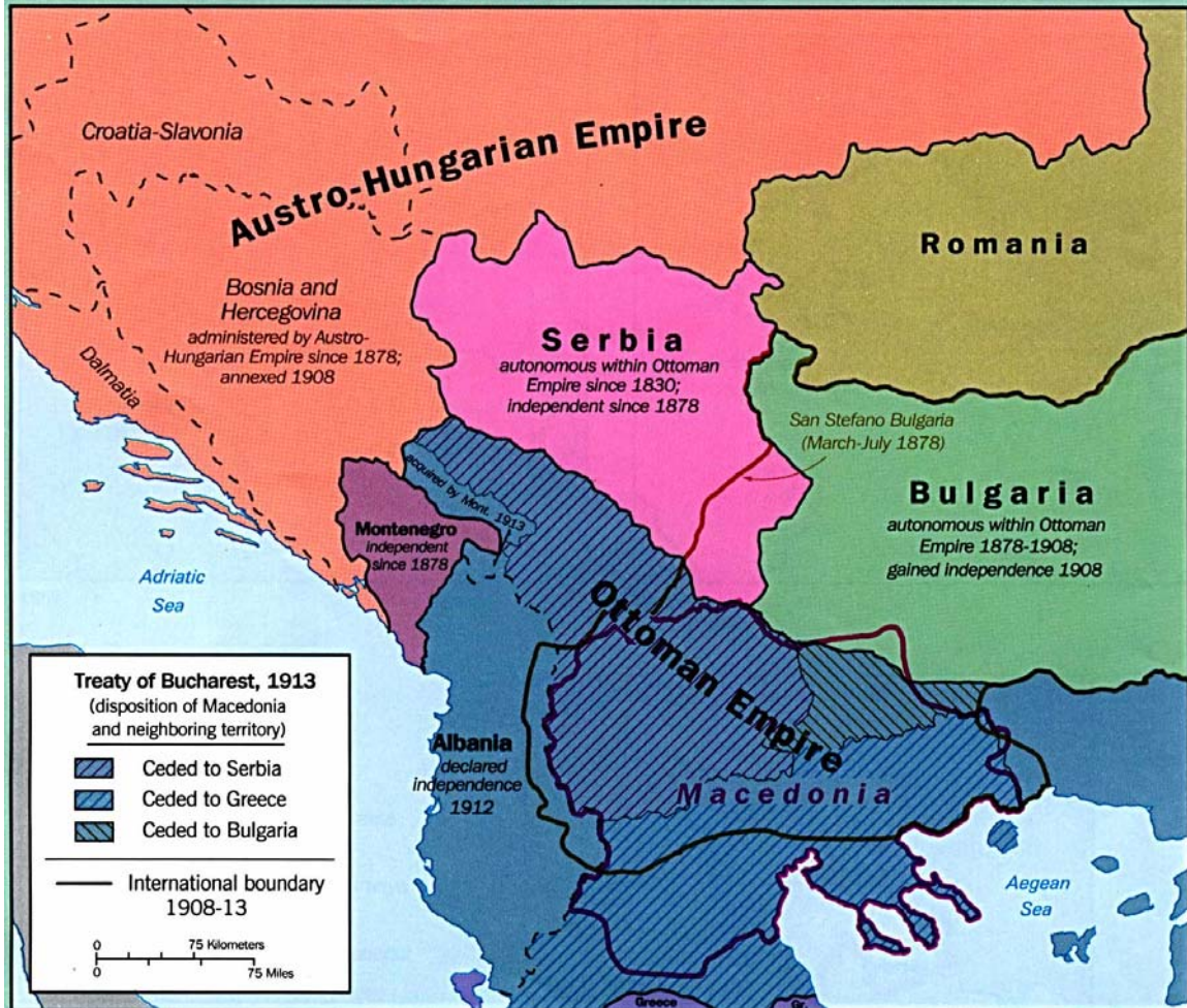
Figure 1. Balkans, 1908 through the Second Balkan War of 1913 18

The first political union of southern Slavs occurred at the end of the First World War in hopes of ending centuries of foreign domination. The southern Slavs did not trust the great powers that were soon to decide the fate of much of Europe. The Kingdom of Serbs, Croats, and Slovenes offered the constituent parts protection from continued subservience to the great powers that would likely have otherwise divided the Balkans up at the end of World War I. However, the formation of this union of southern Slavs was compelled by circumstances, even though some groups, the Croats in particular, favored