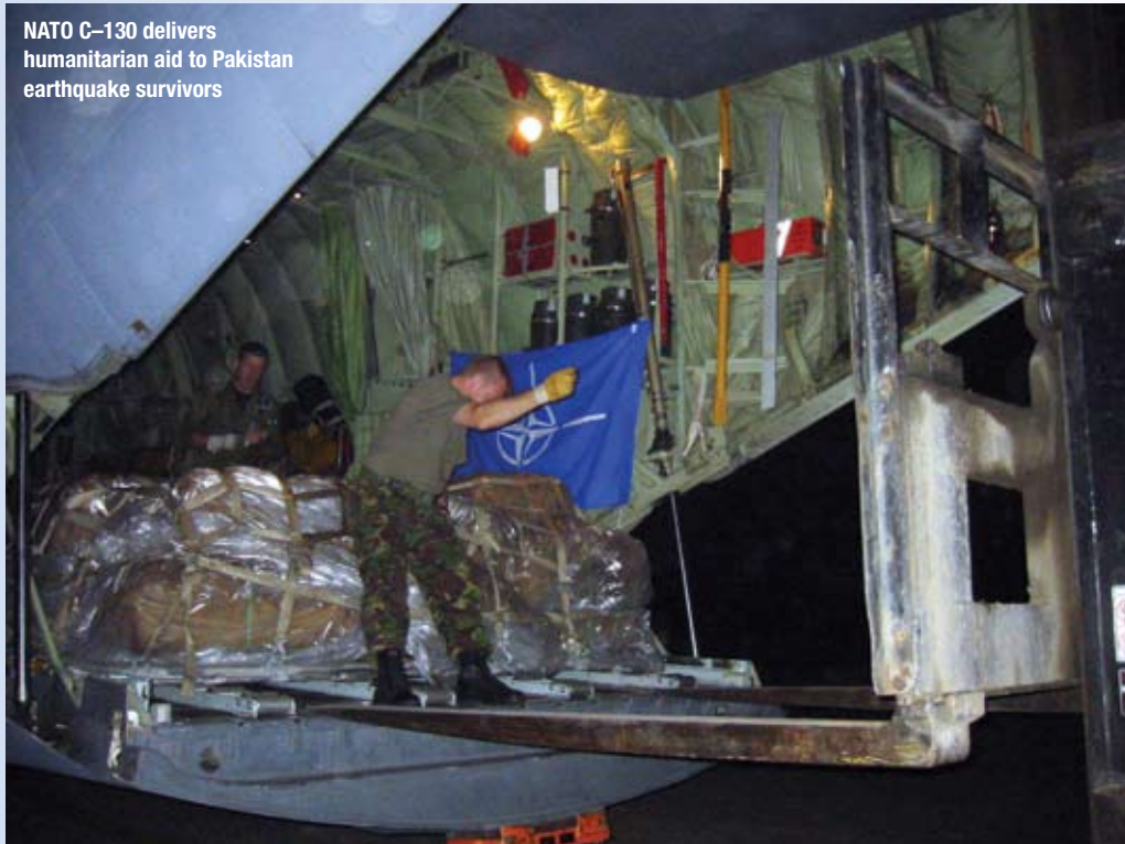
NATO C-130 delivers humanitarian aid to Pakistan earthquake survivors

A key consideration in assessing the Alliance's transformational options is the need to balance the "three-legged milk stool" of acceptable economic and political costs, environmental fit of proposed solutions, and ability to make rapid impact in the operational environment. The transformation of Allied Special Operations capability is an ideal opportunity to achieve this balance while making an appreciable and formative difference in the capabilities of the Alliance. The price in both manpower and resources will not be inconsequential. However, it is well worth the effort in bolstering our collective ability to defeat the global threats of today and tomorrow. JFQ