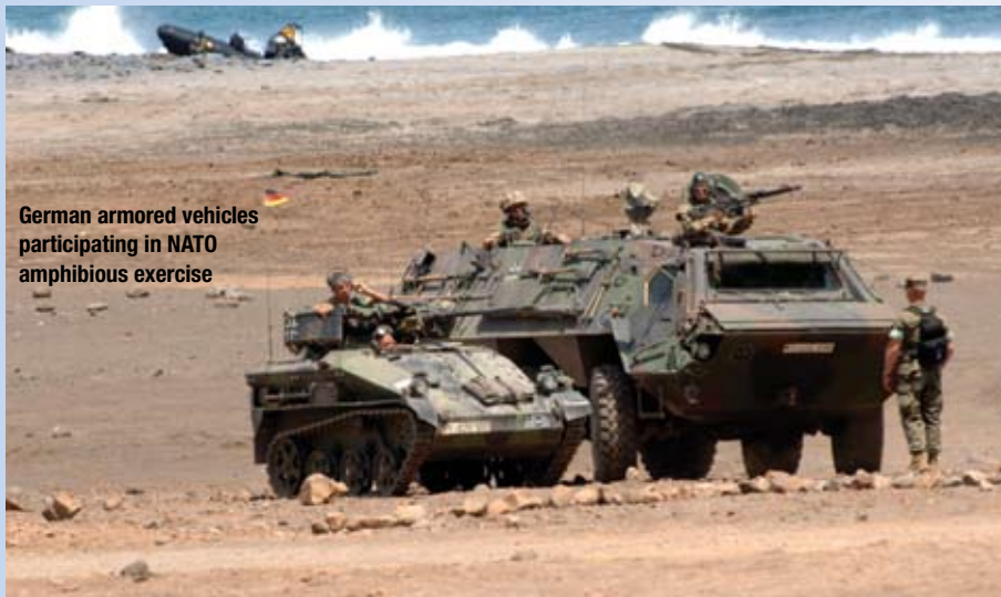
German armored vehicles participating in NATO amphibious exercise