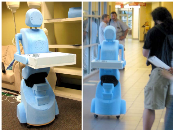
Figure 5. Full-scale mock-up of the robot.

Working from the early sketches described above, we built a number of quarter-scale and half-scale models of the robot. After ascertaining correct proportions for the dimensions of the Pioneer, laptops, and other internal components, we constructed a full-scale mock-up to proportions, radii, and design details (Figure 5). Using this prototype, our design team was able to address dimensions, hardware placement, configurations, assembly, and tray size and arm options.