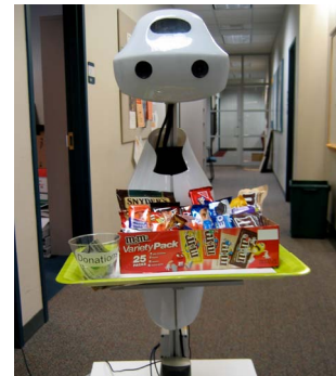
Figure 4. Prototype used for early technology feasibility study.

This early trial helped us learn about many tradeoffs we would face in the future design of the hardware, software, and interaction design of the robot. We subsequently decided to use a commercially available base for the Snackbot. A Pioneer base would be more reliable than a home-built base, and would provide mobile functions that would be easily replicable. It would also be quieter and less distracting to office residents. One drawback of using this kind of base is that it would create a set of constraints for the final industrial design of the robot housing. Such constraints included the dimensions of the robot, the availability (or lack thereof) of mounting points for the torso, and maximum load that could be carried. Our plans for the torso and other electronics exceeded the recommended weight limit of the Pioneer, and so later experiments were performed to learn the maximum reasonable weight the robot could carry while still having reasonable, operational battery life.