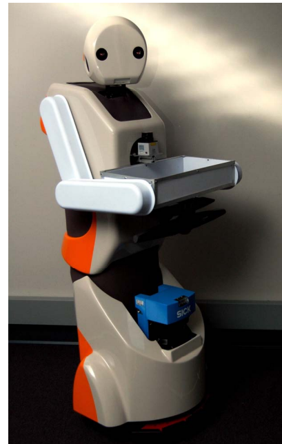
Figure 1. The Snackbot robot.

Copyright 2009 ACM 978-1-60558-404-1/09/03...$5.00.