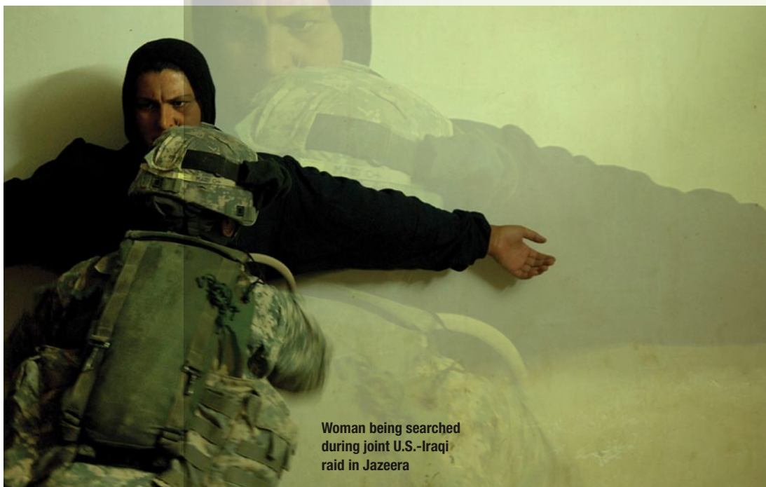
Woman being searched during joint U.S.-Iraqi raid in Jazeera