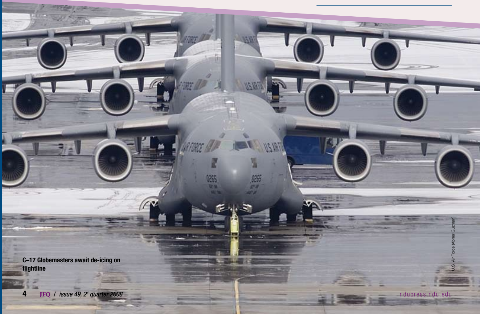
C-17 Globemasters await de-icing on flightline

Secretary Laird intended to produce a maximum Total Force capability through an optimum mix of Regular and Reserve forces in the context of a primarily peacetime garrisoned force