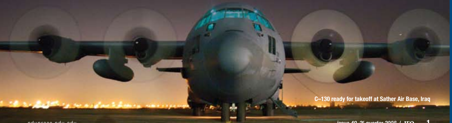
C-130 ready for takeoff at Sather Air Base, Iraq