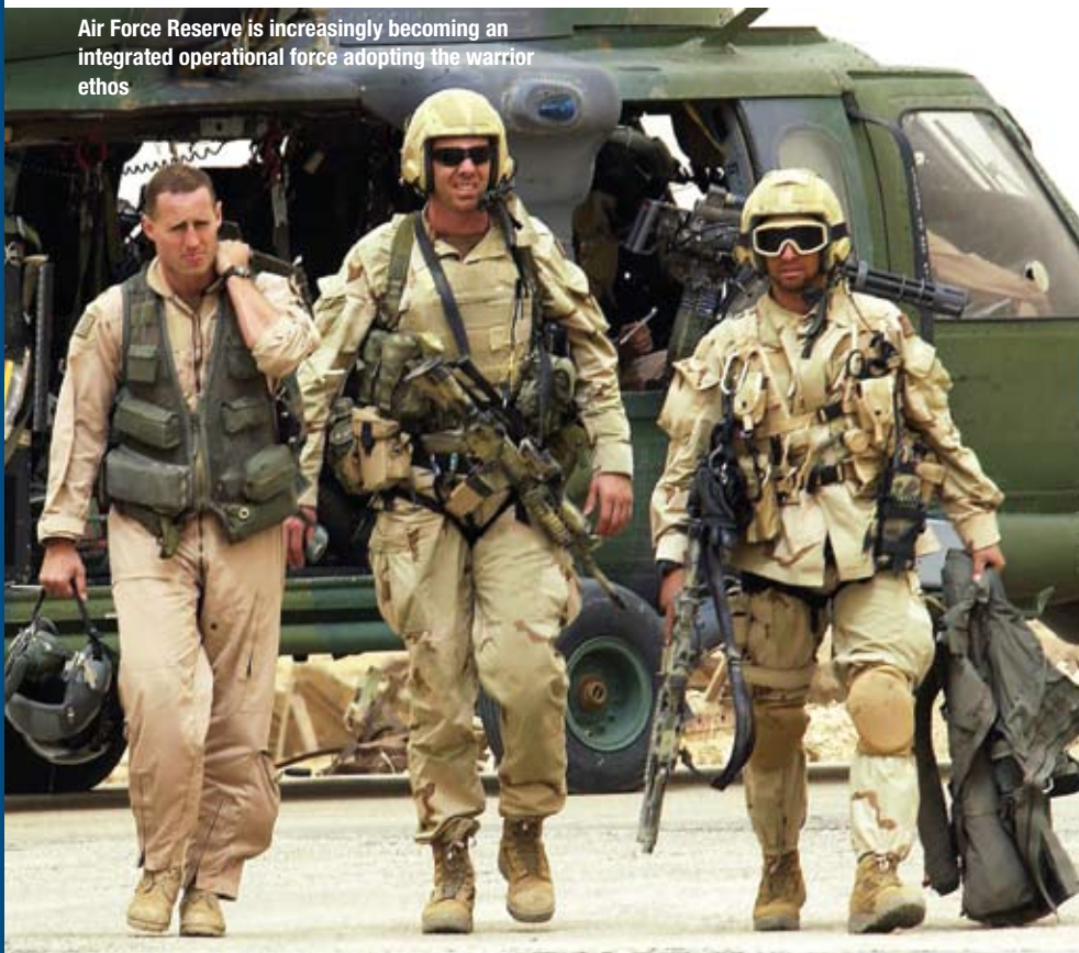
Air Force Reserve is increasingly becoming an integrated operational force adopting the warrior ethos

The mission of Air Force Reservists under Title 10 (the Federal law that authorizes the Armed Forces) is the same as the Regular Component. This alignment with the Regular Component opens the door to a variety of “associate” options that allow the Regular and Reserve Components to work together in cre-