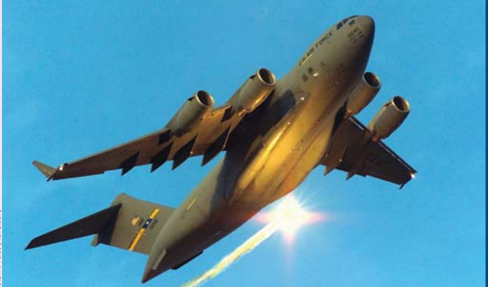
C-17 practices evasive maneuvers during simulated missile attack

By the time Secretary William Cohen released his Total Force memo in 1997, 7 policymakers were recognizing the increasing reliance on Reserve Components and requesting that DOD leaders address any remaining barriers to achieving a fully integrated force.