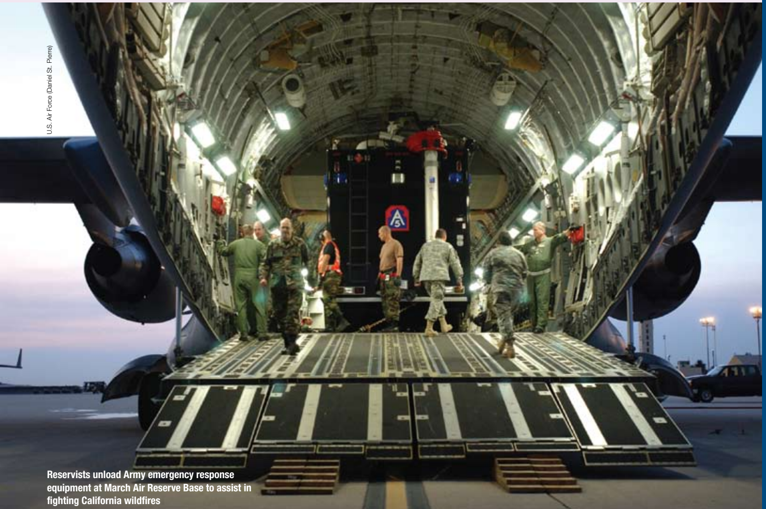
Reservists unload Army emergency response equipment at March Air Reserve Base to assist in fighting California wildfires