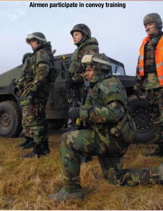
Airmen participate in convoy training