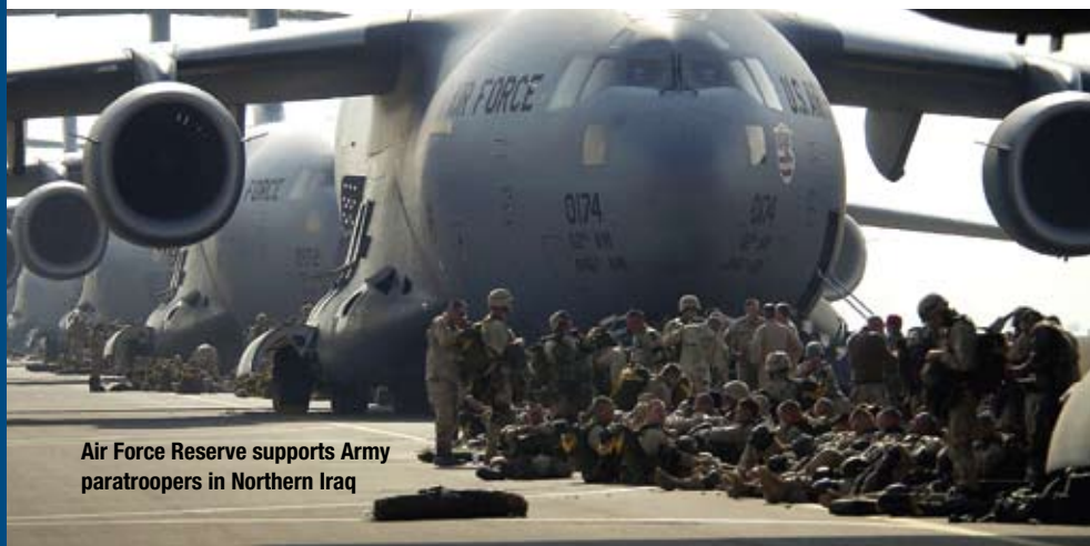
Air Force Reserve supports Army paratroopers in Northern Iraq

Again, operational force policy should begin with the recognition that the term Active duty is no longer the purview of the Regular Component; thousands of Air Force Reservists are on Active duty every day. Our