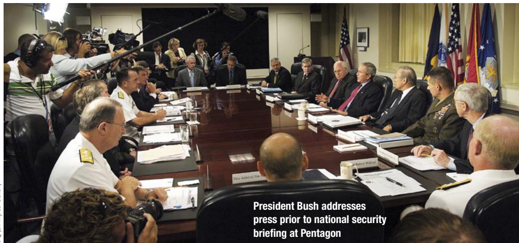
President Bush addresses press prior to national security briefing at Pentagon

A more difficult case for flexible institutions as a measure of professionalism occurs when civilian leaders are perceived as interfering in traditional military operations. For example, the Executive may want to exercise control over where and when a single aircraft launches a single missile against a single target. Civil authorities often may wish to dictate constraints on troop levels, materiel supplies, or the tempo of a military engagement. The professional military must act to create a culture, doc-