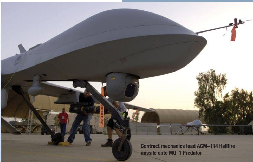
Contract mechanics load AGM-114 Hellfire missile onto MQ-1 Predator