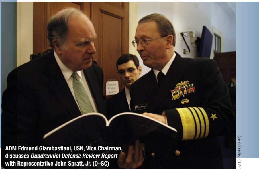
ADM Edmund Giambastiani, USN, Vice Chairman, discusses Quadrennial Defense Review Report with Representative John Spratt, Jr. (D-SC)