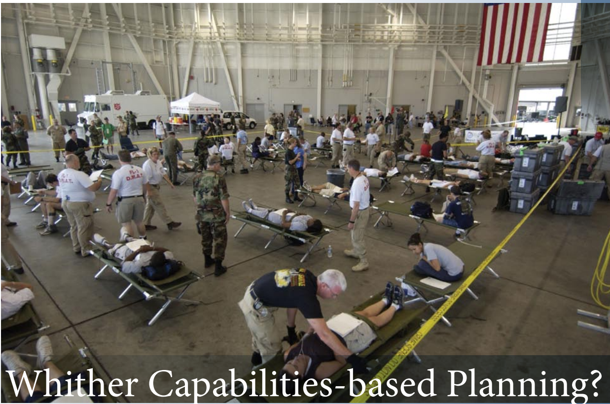
Military personnel work with local, state, and Federal agencies during Exercise Lifesaver 2005, conducted by Homeland Security/ National Disaster Medical System