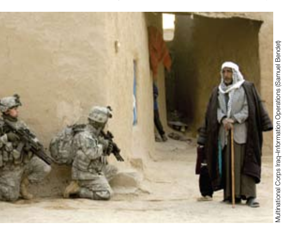
Iraqi man and child wait as Soldiers prepare to search their home

Clausewitz's famous dictum that war is a continuation of policy by other means dominates contemporary Western thinking about war.<sup>13</sup> Yet in an increasingly complex world, a troubling issue arises: can traditional military force be applied against a nonstate actor, and if so, how? This question, significantly beyond the scope of the current article, nonetheless constitutes one of the dominant issues of our time. It also strikes at the heart of the Russian Chechen conflict. While the traditional nation-state employs violence within the constraints of its responsibilities for self-preservation and the general betterment of its citizentry,