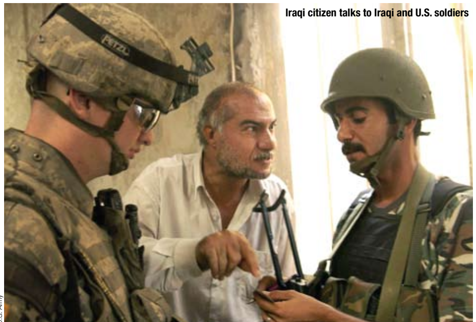
Iraqi citizen talks to Iraqi and U.S. soldiers

Internet and broadcast videos glorifying attacks on Western forces, may generate a few recruits, but without a semi-overt political organization able to communicate quickly and frequently with large numbers of people, al Qaeda is unlikely to produce mass activism in any form, violent or non-violent. On the other hand, Hizballah, which some analysts have called the world’s most effective Islamic insurgency, has built an efficient grassroots organization on Lebanese territory with strong government-like social services. 33