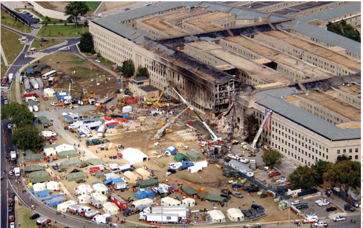
Damage to Pentagon after September 11 attack

movement to the leadership, at least at a nominal level, of a global Islamic insurgency in order to destroy Western influence in the Muslim world and reestablish the historic caliphate. 1 Although many Muslims viewed al Qaeda's early attacks as heroic acts of defiance against unjust U.S. policies, al Qaeda has failed to make the transition to a popular insurgency or win any permanent gains as a result of its conceptual, organizational, and material shortcomings. These include an over-reliance on violence, weak efforts to organize