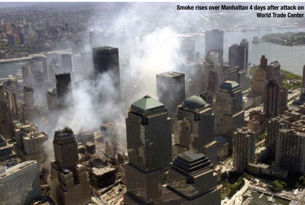
Smoke rises over Manhattan 4 days after attack on World Trade Center

Nevertheless, al Qaeda does have a strategy—to try to foment a global Islamic insurgency in four stages. According to multiple writings by prominent al Qaeda thinkers—including Abu Bakr Naji's The Management of Savagery , Zawahiri's Knights under the Prophet's Banner , and Abu Hajir al Muqrin's A Practical Course for Guerrilla War —the first stage is the awakening. During this phase, al Qaeda doctrine calls for small terrorist cells, funded and directed by al Qaeda's central apparatus, to conduct spectacular mass-casualty attacks against symbolic U.S. targets and other sources of preexisting Muslim resentment to lift what al Qaeda considers a malaise of Islamic defeatism. 7 Al Qaeda believes such violence can radicalize the Muslim population in a way that simple proselytizing cannot. Naji, for example, calls this "reviving dogma and jihad in the hearts of the Muslim masses" and removing the "deceptive media halo" around American power. 8