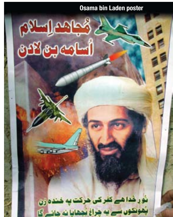
Osama bin Laden poster