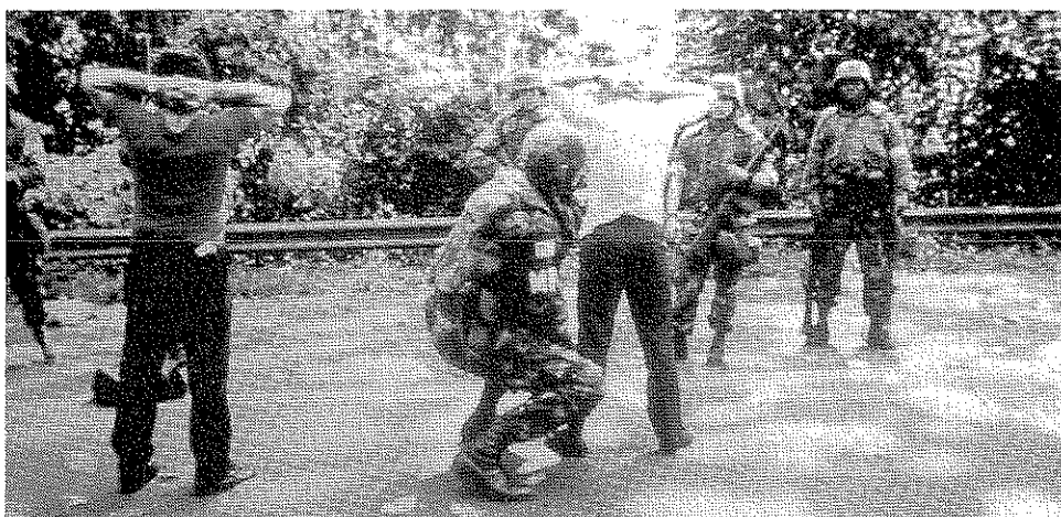
MPs search suspects during Operation Just Cause in Panama, December 1989.

While the desirability of military police as principal forces decreases as threat lethality increases, military police traditionally perform many critical tasks in support of forces engaged in combat operations. MP participation throughout all phases of contingency operations can relieve combat forces of tasks that detract from their primary mission. During the American intervention in the Dominican Republic in 1965, for example, difficulty in placing military police units on the ground early resulted in a shortage of personnel available to guard detainees. In one instance US troops handed rebel prisoners (Constitutionalists) over to Loyalist soldiers, who promptly shot them. 5 General Bruce Palmer, Jr., who commanded US forces during the Dominican intervention, summed up his thoughts on the use of military police units as follows: "The military police