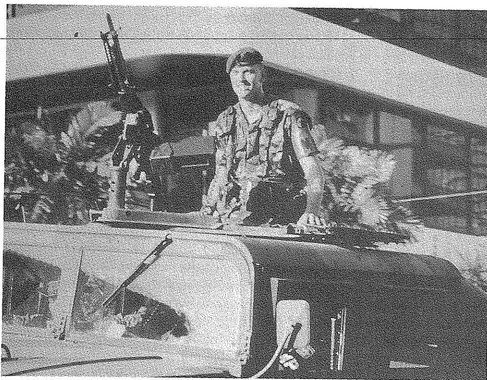
XVIII Airborne Corps

MPs proved again during Operation Just Cause that they are well-suited to fill a variety of roles in contingency operations.