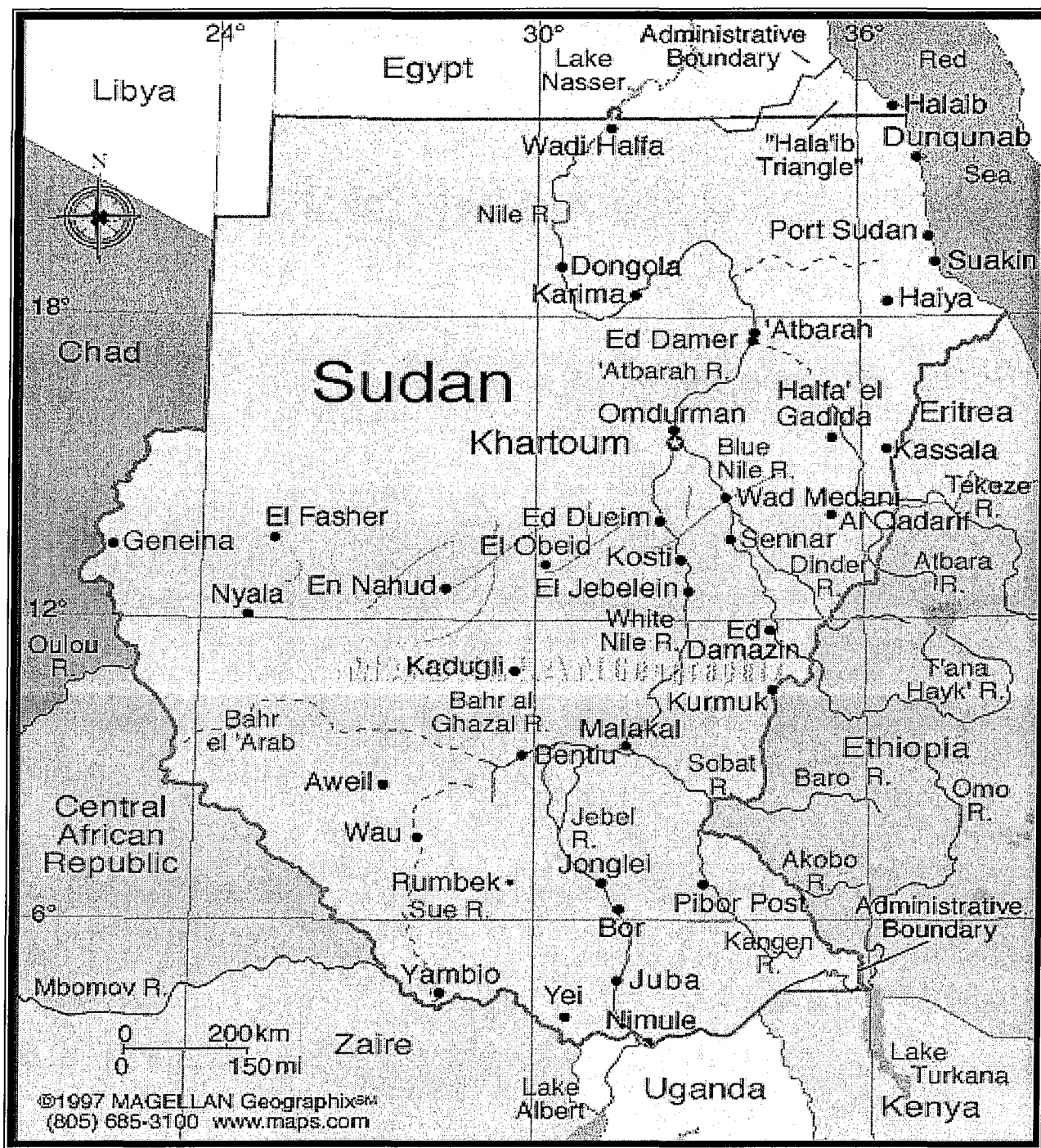
Appendixes (B) Sudan cites.