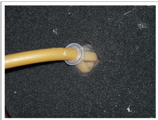
Figure 2 Connection of gravity drainage to the nipple using Malecot drain through the superficial side of the sponge.

During final positioning, a small hole is cut in an appropriate location to accommodate the nipple/catheter apparatus. If an appropriately sized orifice has been cut, one should be able to obtain a seal around and onto the nipple itself. If necessary, however, the plastic covering the sponge can be extended onto the catheter itself to ensure an adequate seal for subsequent vacuum. Particular care should be taken