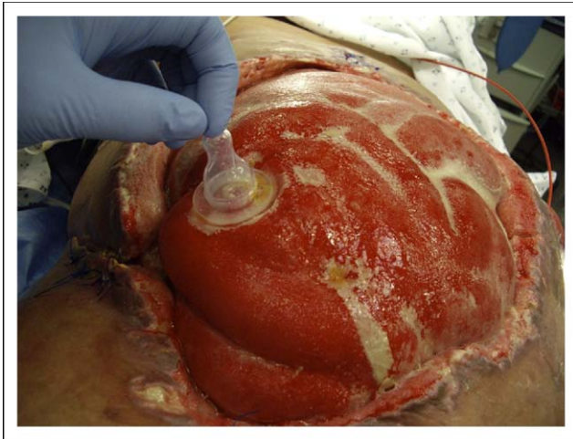
Figure 1 Baby nipple coverage of fistula in a chronically frozen abdomen.

inflated balloon can be connected (Fig. 2). The catheter is properly positioned in the apex of the nipple so as not to contact the bowel or fistula orifice directly (Fig. 3). A nonadherent, petroleum jelly-impregnated gauze or clear Telfa sheet (Tyco Healthcare, Mansfield, MA) is then placed over the bowel excluding the area that the nipple covers in the region of the fistula. Finally, an abdominal wound vac (Wound Vac; KCI, Corp., San Antonio, TX) sponge is tailored to fit over the petroleum dressing covering the exposed bowel. We do not advocate direct contact of the sponge with the exposed bowel because of concerns for additional fistula development.