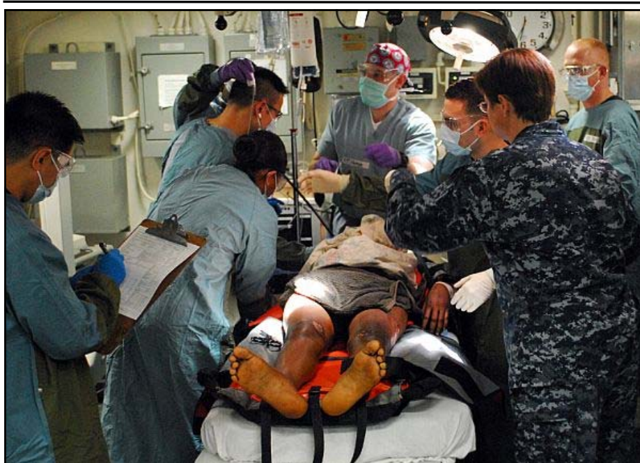
PORT-AU-PRINCE, Haiti—Medical personnel from the multi-purpose amphibious assault ship USS Bataan (LHD 5) provide medical care to a woman airlifted to Bataan from a small village in the vicinity of Port-au-Prince, Haiti, Jan. 19, 2010. Bataan is supporting Operation Unified Response, a joint operation providing humanitarian assistance following a 7.0 magnitude earthquake that devastated the island nation Jan. 12, 2010.