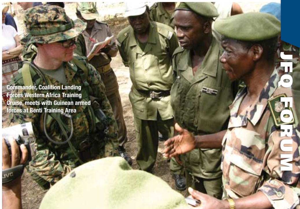
Commander, Coalition Landing Forces Western Africa Training Cruise, meets with Guinean armed forces at Benti Training Area

ties. Composed of an array of coastal radar systems, this system would allow African coastal nations to detect and track vessels out to 25 nautical miles from the sensor in all weather conditions. Coupled with a naval reaction force, RMAC could impede smuggling, piracy, or illegal fishing in the host nation’s waters.