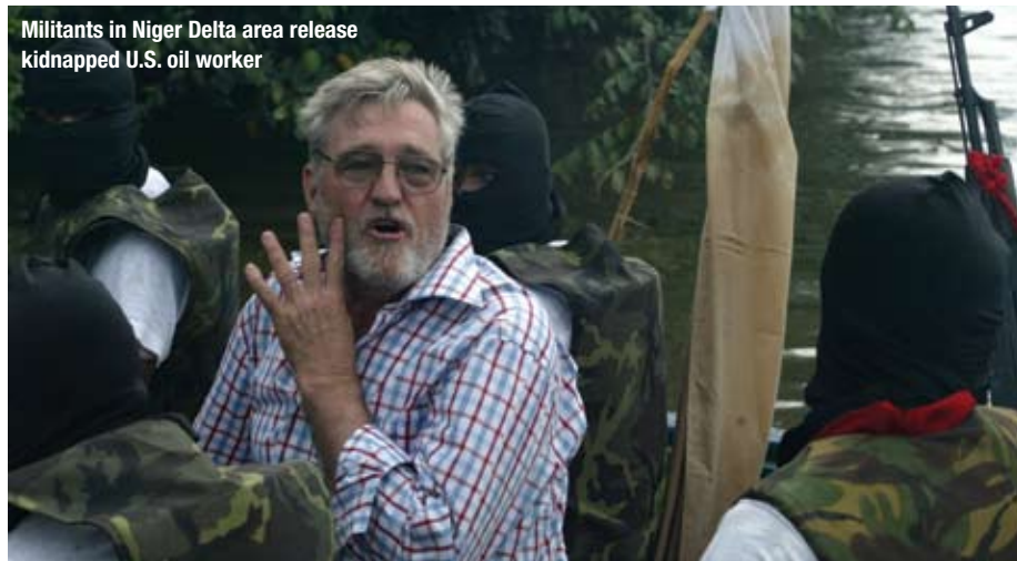
Militants in Niger Delta area release kidnapped U.S. oil worker