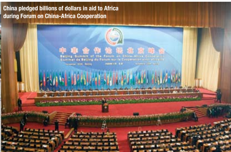
China pledged billions of dollars in aid to Africa during Forum on China-Africa Cooperation

future African markets for the sale of Chinese exports. Taken together, these steps will allow China to have access to both raw resources and export markets.