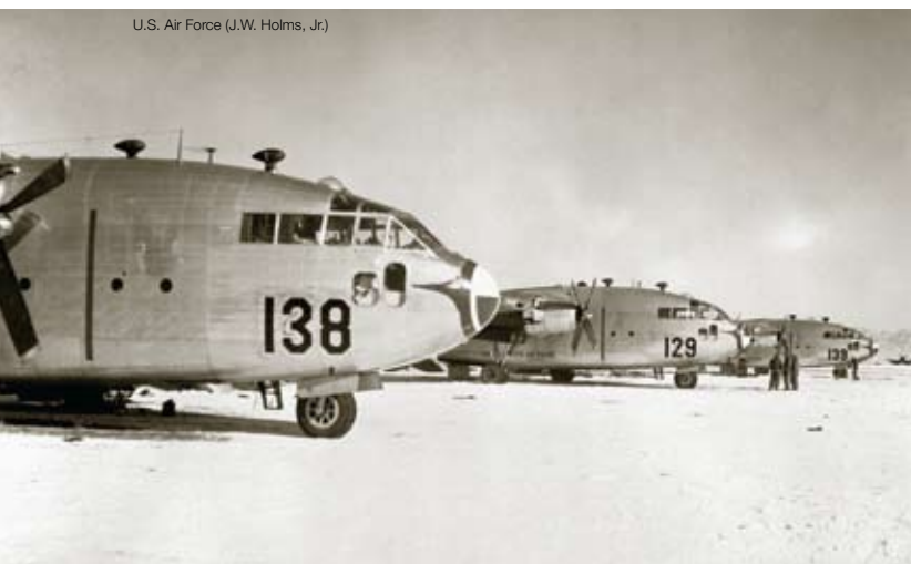
U.S. Air Force (J.W. Holms, Jr.)