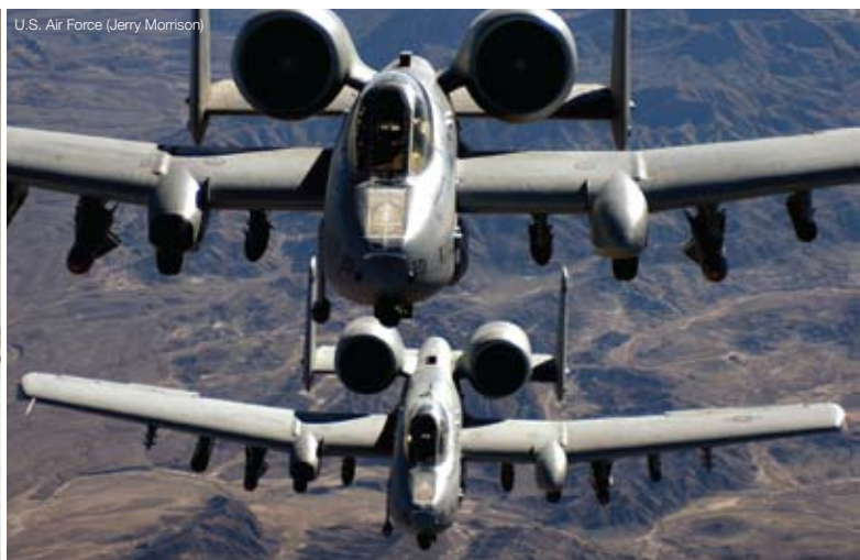
U.S. Air Force (Jerry Morrison)