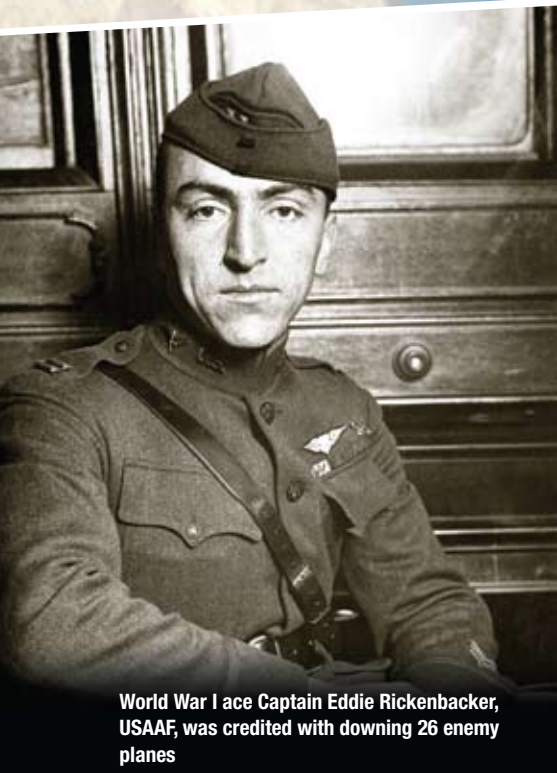
War Department (Underwood and Underwood)